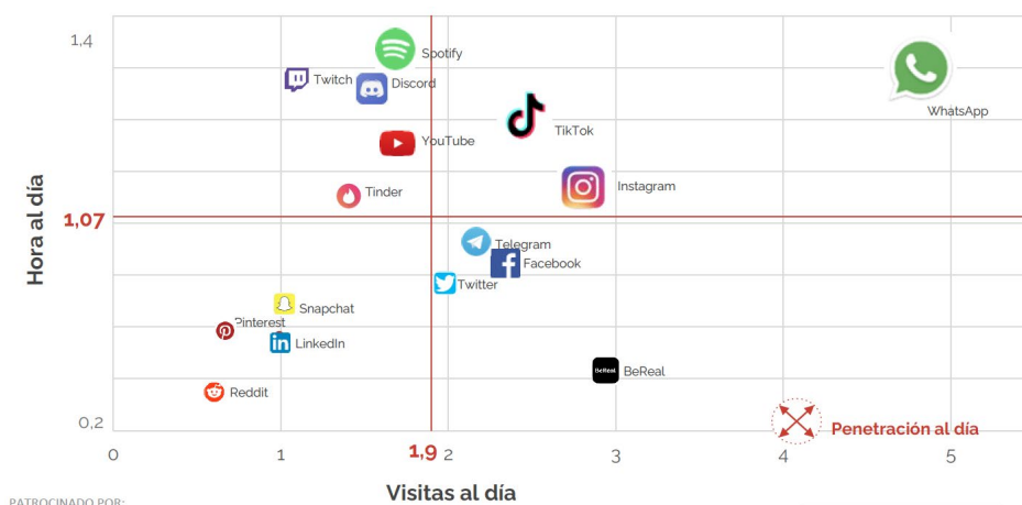
Figure 3. Use of generalist social networks: frequency vs. intensity (Year 2023).