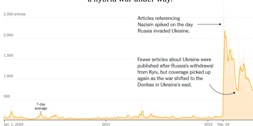
Graph 1. Appearance of articles in Russian media linking Ukraine with nazism. The numbers shows that there is a hybrid war under way.

In this case, Russia constructed a narrative that aligned president Volodymyr Zelensky and, therefore, the entire political leadership of the country, with Nazism. Egbert Fortuin asserts that the main justification for starting the war "was the genocide of the Russian-speaking population by the Nazi government" (2022, p. 313). A study published by The New York Times verifies this claim: in the month Russia crossed the border of the neighboring country, the number of articles per day increased from about one hundred to an average of a thousand (Graph 1), all associating the Kiev government with national socialism.