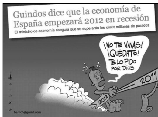
Figure 1. Political cartoon of Elrich where personification is used.