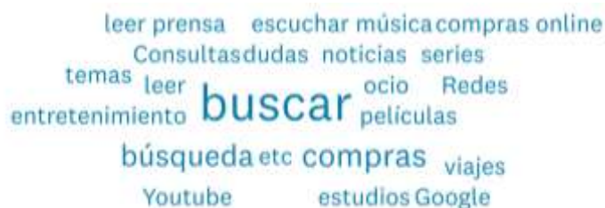
Figure 1. Word cloud on Internet use