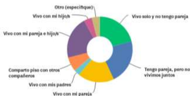
Graphic 2. Situations with which respondents identify.