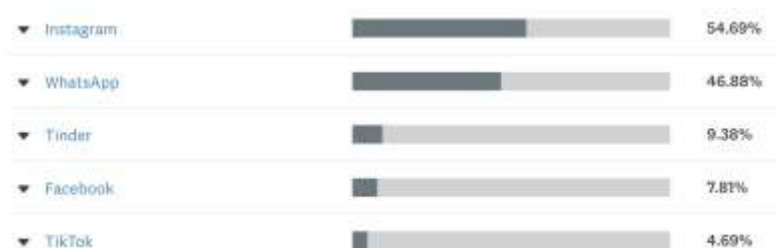
Graphic 4. Most used applications by non-single respondents.