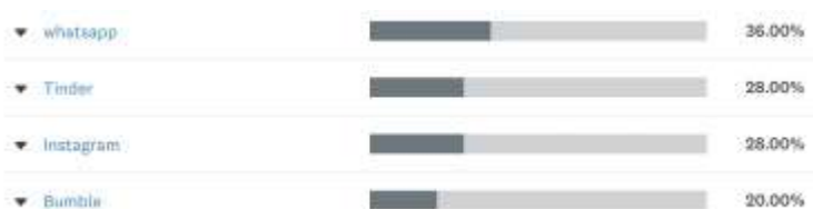
Graphic 3. Most used applications by single respondents.