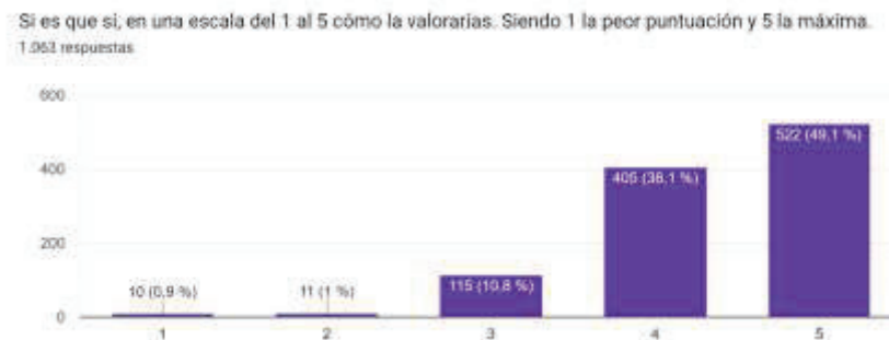
Figure 10. Feedback on implementation.

The level of satisfaction offered by the application is noteworthy. Over 88% of respondents rate it highly satisfactory, giving it a score of 5 out of 5 (49.1%), followed by a score of 4 out of 5 (38.1%).