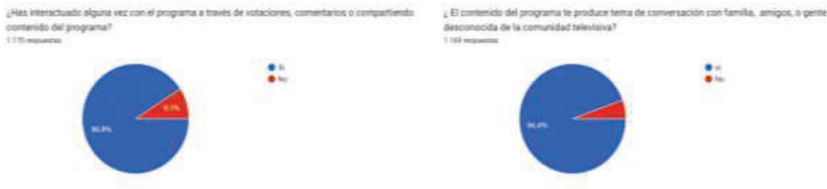
Figure 4. OT viewer interaction

Interaction extends beyond television broadcasts. A substantial majority of respondents, 94.4%, reported engaging not only in sharing content across various platforms but also in expressing opinions and discussing programme events with family, friends, and fellow members of the television community who are followers of the format.