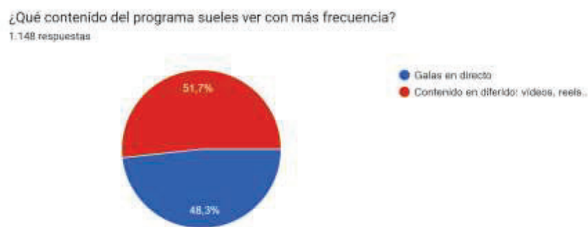
Figure 7. Content frequency

92.3% of those surveyed indicated that they track the programmes through social networks. It is noteworthy that nearly half of them watch the galas live (48.3%), while the remaining half (51.7%) opt for deferred viewing. This underscores the attainment of a primary objective in this groundbreaking edition. "We have been the first in the world to offer great live entertainment on a streaming service for fourteen weeks, and we have done it successfully" (Amazon, 2024).