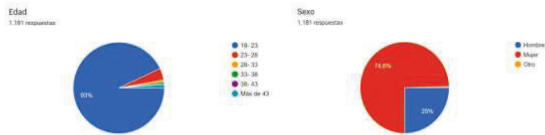
Figure 1. Socio-demographic variables

Regarding the respondents' gender distribution, a considerable disparity is observed between male and female participants, with women constituting 74.6% and men accounting for 25%. Hence, it is evident that the predominant demographic among OT network users comprises young women aged 18 to 23 years.