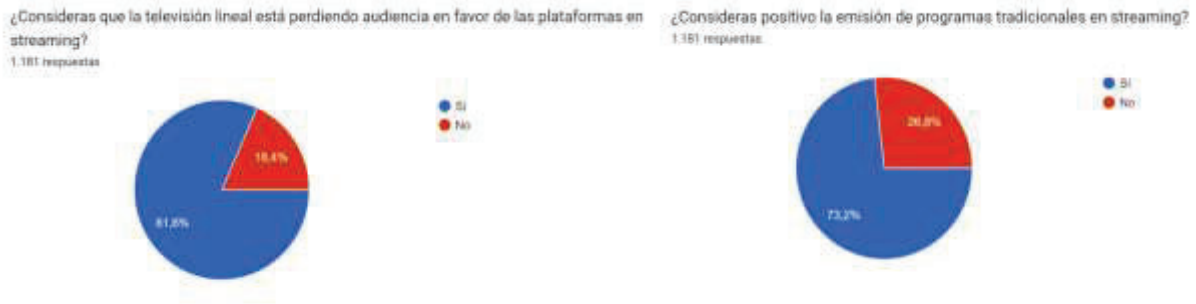
Figure 11. Linear Television vs. Streaming