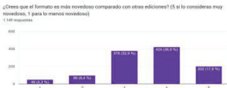
Figure 5. Comparison of previous editions

When asked about their evaluation of previous editions, the majority of respondents perceive the 2023 format to be novel. At the ends of the spectrum, 17.6% of respondents regard it as highly novel, while 4.3% perceive it as entirely familiar.