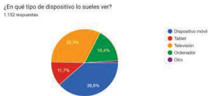
Figure 2. Devices used

When analysing the devices utilised by respondents for viewing programme content, the findings indicate a prevalence of mobile devices, accounting for 38% of respondents, closely followed by television at 32%. Computers comprise a smaller proportion at 16%, with tablets trailing significantly at 11.7%.