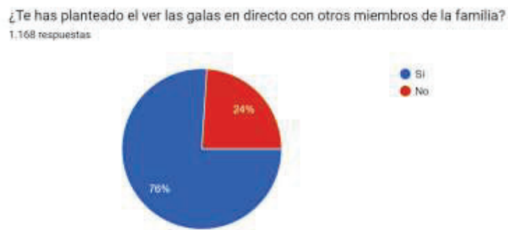
Figure 6. Watching live galas with family members

This transformation, highlighted by the Head of Original Content for Prime Video in Spain during a press conference, illustrates how the programme has become a unifying element for families and across generations. "We are delighted that Operación Triunfo has become an event, a moment of reunion for families and friends during these three months. The programme has united generations; those who enjoyed the first edition in 2001 and the young people who have discovered it 20 years later" (Amazon, 2024).