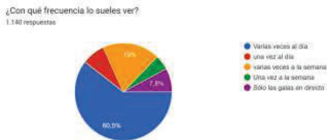
Figure 3. Frequency of programme viewing