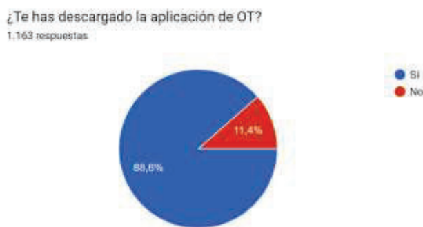
Figure 9. Operación Triunfo App

Concerning the programme's official app, 88.6% of surveyed viewers indicated that they had downloaded the app. This app stands as one of the significant digital innovations that revolutionised the 2017 edition, and it has persisted in the 2023 edition as a strategy for dissemination and interaction with viewers. "The official programme app has garnered a total of 1.6 million users, surpassing the previous record of 820,000 registrations in the 2017 and 2018 editions" (Amazon, 2024).