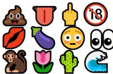
Figure 13: Hate and sexual emoticons