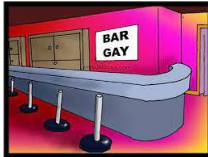
Figure 17: simple drawing with an offensive and caustic meaning