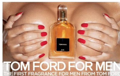
Figure 20: Tom Ford's perfume