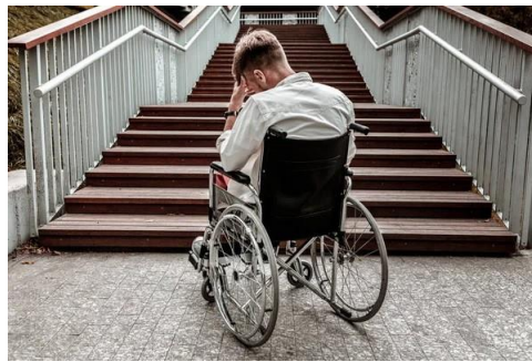
Figure 16: In front of a barrier