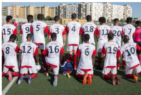
Figure 22: Footballers with the insult they receive for their colour on their back