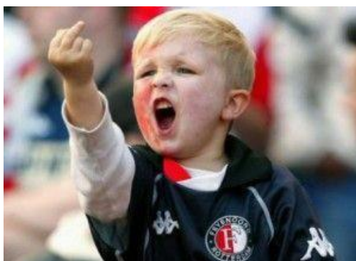
Figure 22: Sport values: How to learn hate and sexist speech in non-verbal communication?

Among the mass of people who go to sports stadiums, especially soccer stadiums, and due to the rivalry between the different teams, it leads spectators to demonstrate with enormous violence. In some cases: breaking stadium furniture, assaulting athletes, and even killing innocent people in the worst cases. It should be noted that in many sports, and especially in soccer, passion, aggressiveness, and violence are surprisingly present and intertwined, and are represented by all kinds of insulting words, but also by non-verbal communication of hate speech, especially if the result is adverse: shouting, hand gestures, glares, etc. Aggressiveness is often conveyed.