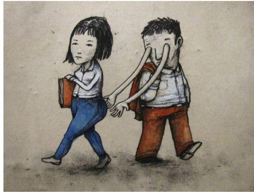
Figure 12: sexual and gesture harassment in the street