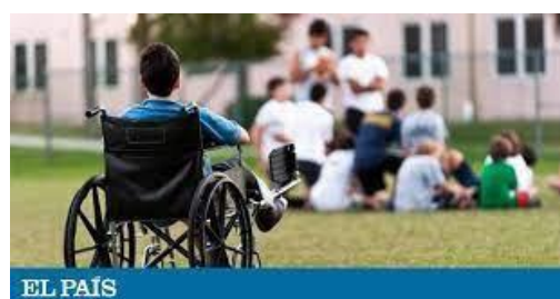
Figure 15: A teenager in a wheelchair watches his peers playing in the park as they exclude him.

Islamophobia, or contempt for people of North African origin and Islamic religion, is a popular target of verbal and non-verbal hate speech. The use of the insulting and derogatory word “moro” (in Spanish) is an example.