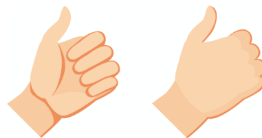
Figure 1: Thumbs up with clenched fist