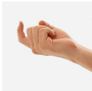
Figure 4: Asking someone to come with the finger

If you make this sign backwards, i.e., with the palm of your hand facing you, in the UK, Australia, Ireland and New Zealand it is an insult and means “fuck you”. Anecdotally, this happened to George Bush in 1992 when he was President of the United States. During that visit, farmers in Canberra (Australia) were protesting the US government because of the subsidies that the American government was offering their farmers, indirectly harming Australian products. George Bush made the ‘V’ gesture as a sign of peace, but the effect was the opposite, with the farmers interpreting it as an insult.