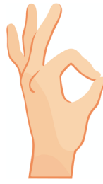
Figure 2: Join thumb with index finger