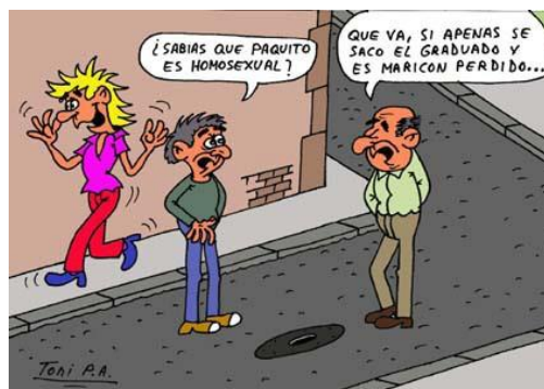
Figure 18: caricature of a homosexual