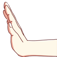
Figure 7: Raise your hand with open palm