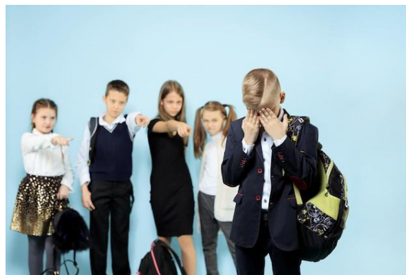
Figure 11: Little boy standing alone and suffering an act of bullying while children mocking