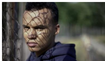
Figure 14: Young migrant in front of a barrier