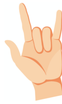
Figure 5: Raise index finger and little finger