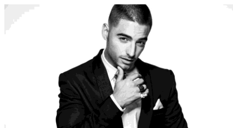
Figure 21: Maluma as a macho man