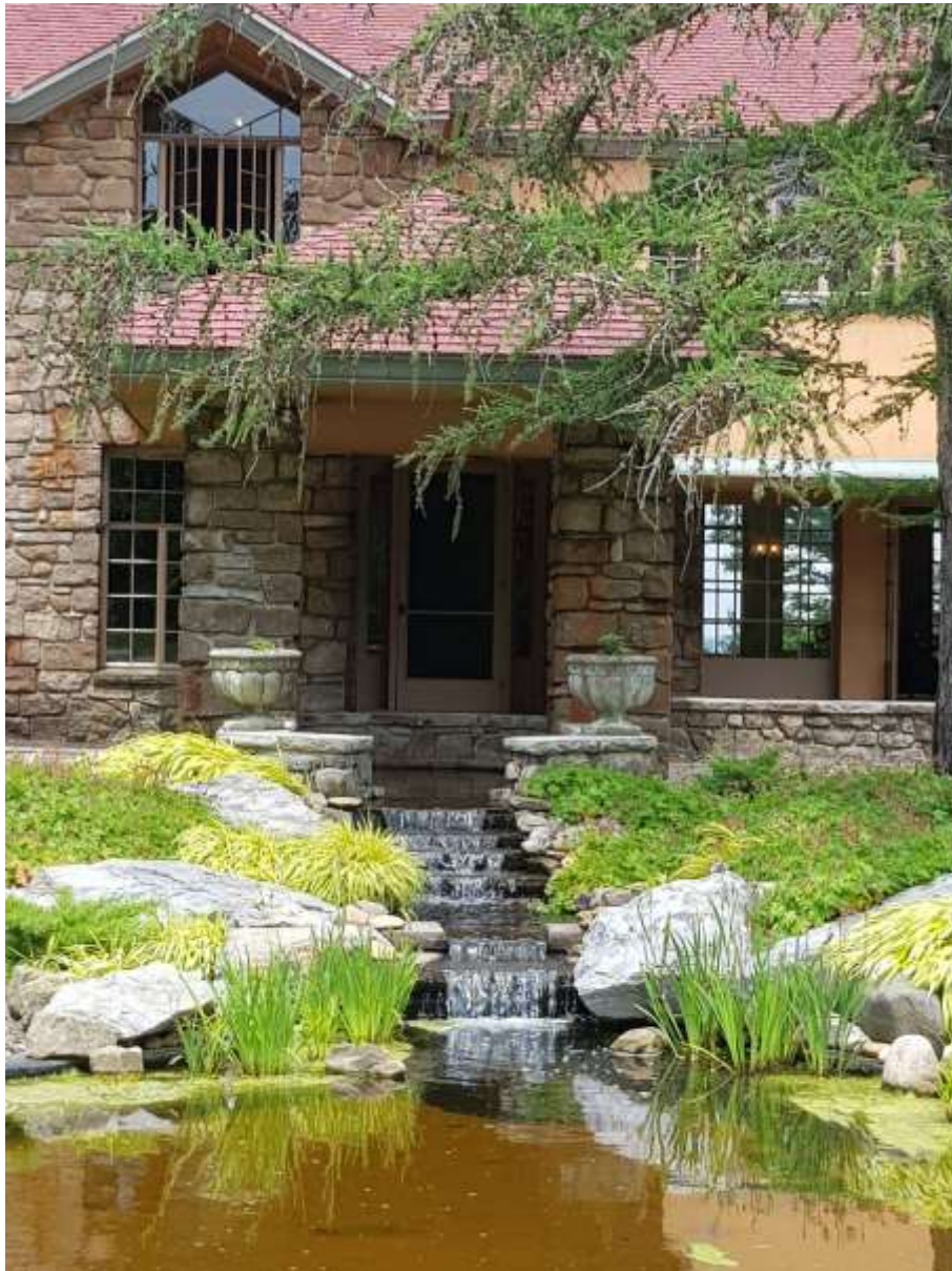
Figure 9. View of the stepped waterfall in the carriage porch

The stepped waterfall introduces the movement of water from an octagonal basin, close to the columns of the carriage porch. Its fall onto the axis perfects the symmetry of the porch, which acts as an architectural grotto and backdrop, before beginning its journey southward, feeding the small artificial lake and awakening the senses with the vibrant sound and freshness of the flowing water (Figure 9).