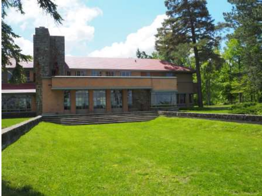
Figure 6. North view of the main house.