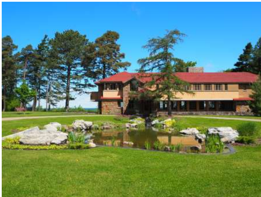
Figure 8. View of the pond located to the south of the house