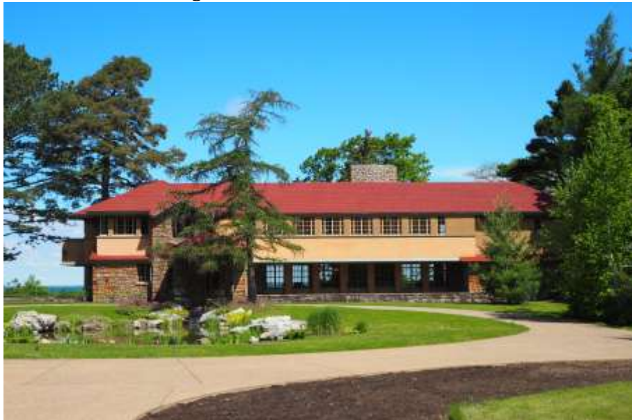
Figure 5. South view of the main house.