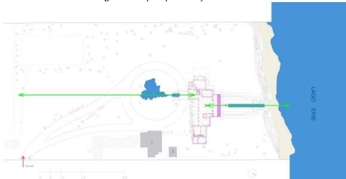
Figure 3. Complete plot of Graycliff House

In September 1927, Wright sent a color plan showing the complete set of buildings, which included ideas for the treatment of the outdoor spaces. The plan includes sketches of unbuilt parts, reflecting the lively work and debate with Mr. and Mrs. Martin. It shows a guest pavilion adjacent to the garage and a tennis court to the west, which ends up filling the northern third of the original plot.