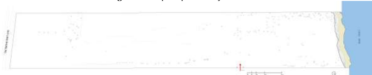
Figure 2. Complete plot of Graycliff House

The Graycliff House plot is set in an extraordinary natural environment, on a steep cliff overlooking Lake Erie. It has an approximate area of 3.5 hectares in a rectangular shape with a main northwest orientation. However, originally, the northern third (bordering the lake) was accessed from the east via a right of way across the adjacent property (Figure 2).