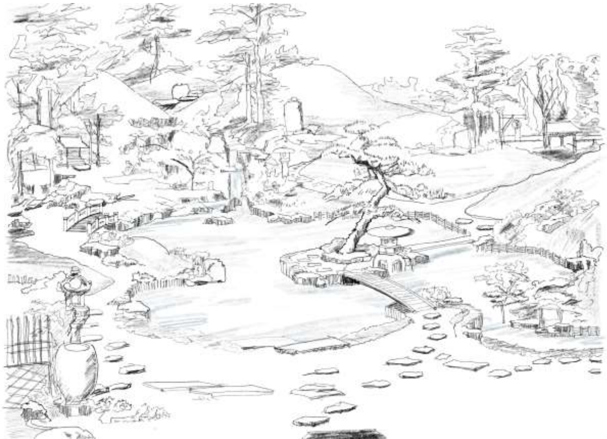
Figure 7. Redrawing of plate XXV by Conder