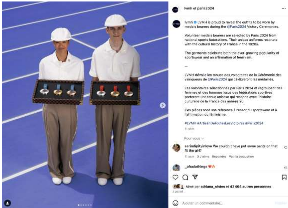
Figure 1. First post made by @Paris2024 in relation to LVMH on Instagram.

published by the group, showcasing the uniforms of the volunteers entrusted with the responsibility of carrying the trays bearing the medals presented to the awarded athletes.