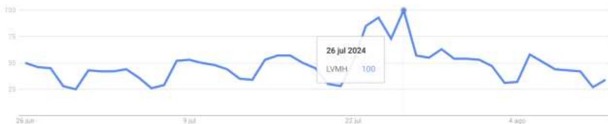
Figure 4. Interest in the term LVMH worldwide between 26 June and 11 August 2024

The results of the same queries from around the world provide the following information: