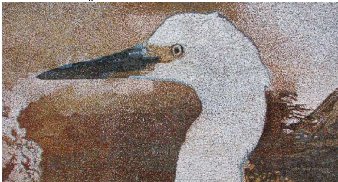
Figure 2. Giant head of a bird from time immemorial.