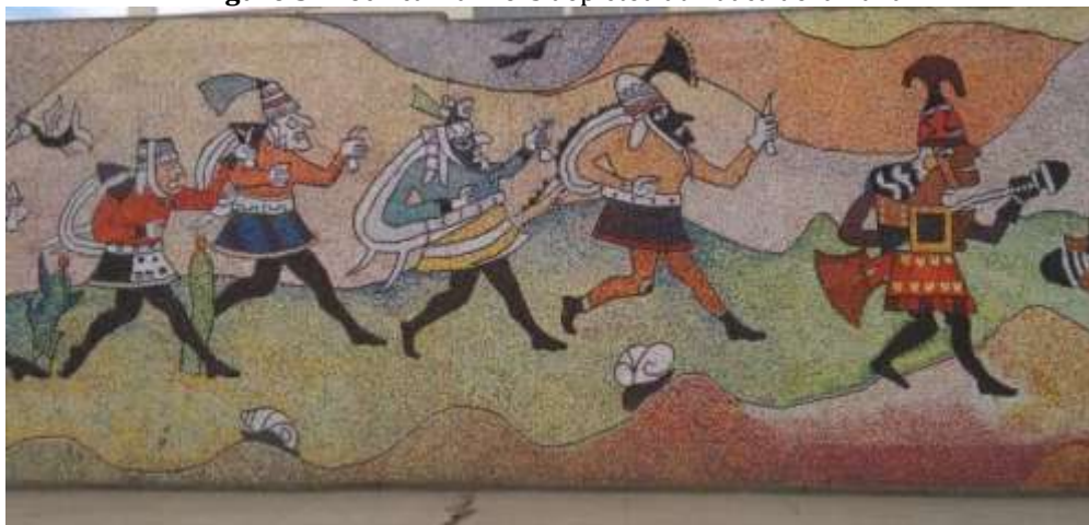
Figure 3. Mochica warriors depicted at Huaca de la Luna