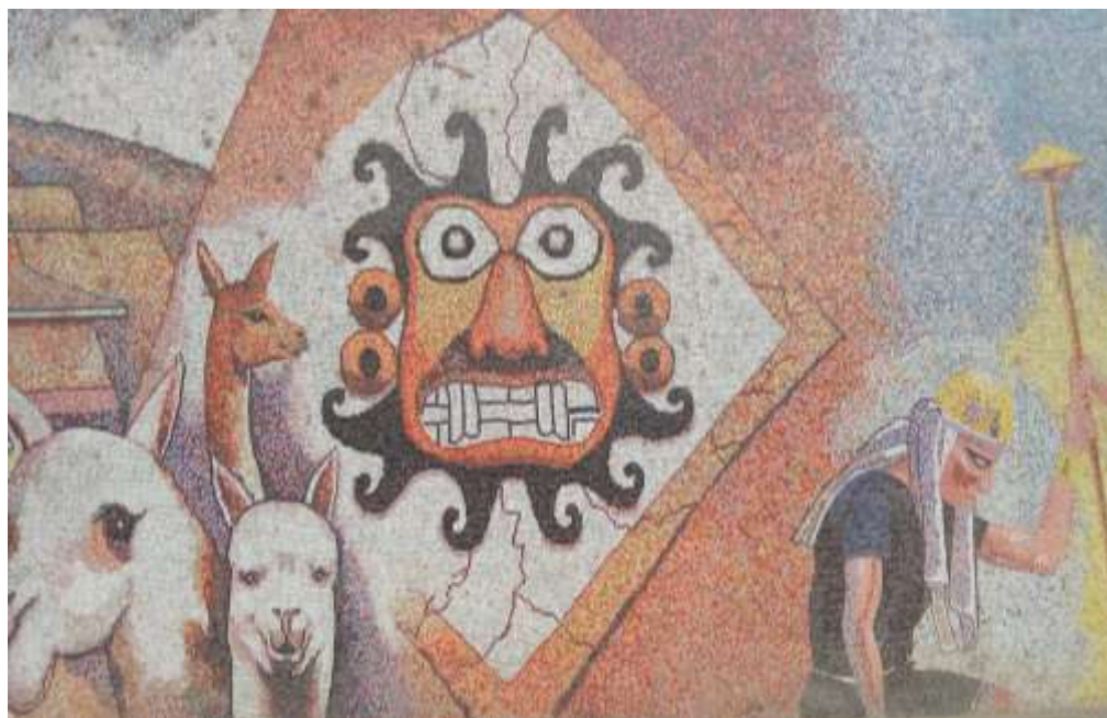
Figure 5. The god Aipaec or Degollador, the deity of the Moche culture