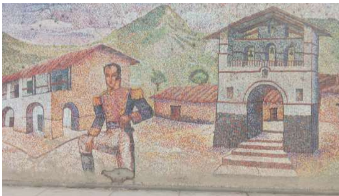
Figure 1. Sánchez Carrión, bell tower and house with arches in Huamachuco.