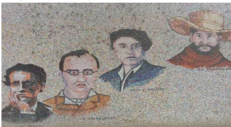
Figure 4. Representative figures from the history of the university and Peru