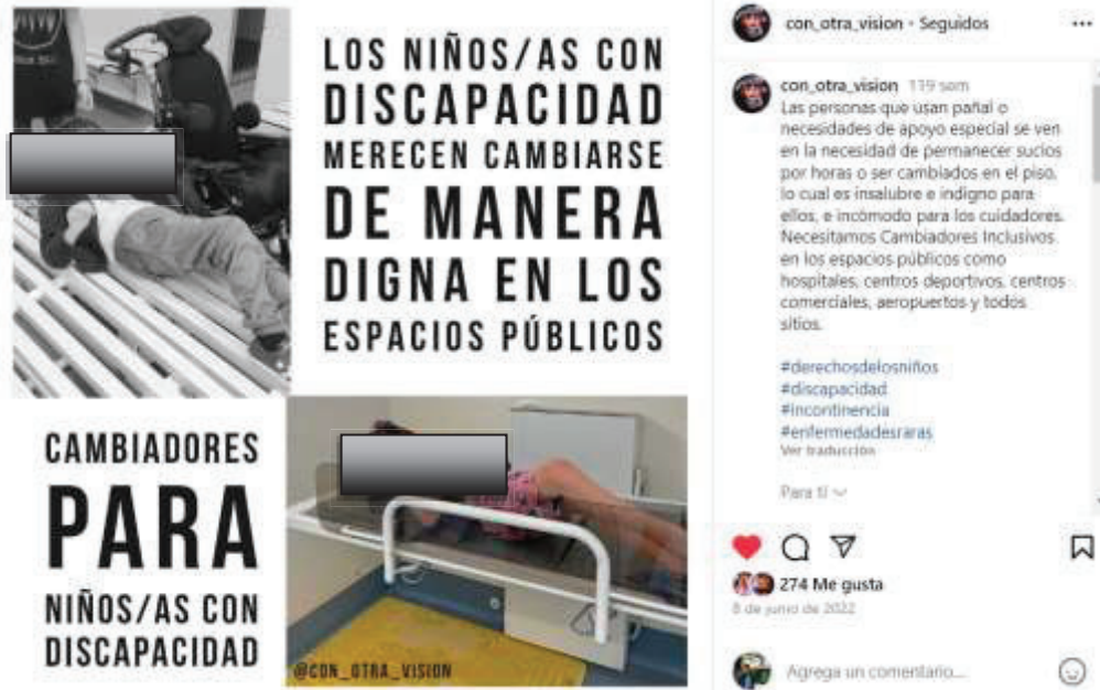
Figure 7. Publication calling for inclusive changing facilities