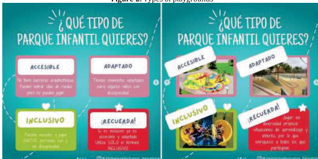
Figure 2. Types of playgrounds