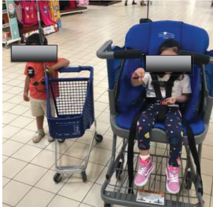
Figure 10. Shopping with an adapted trolley