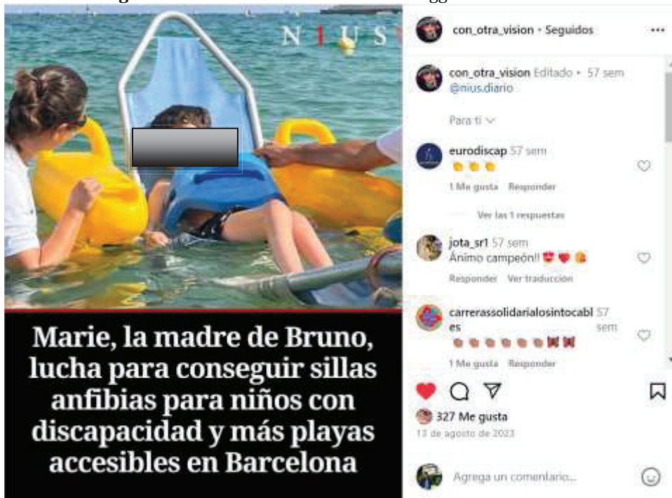
Figure 4. News about Marie Pierre's struggle on the beaches