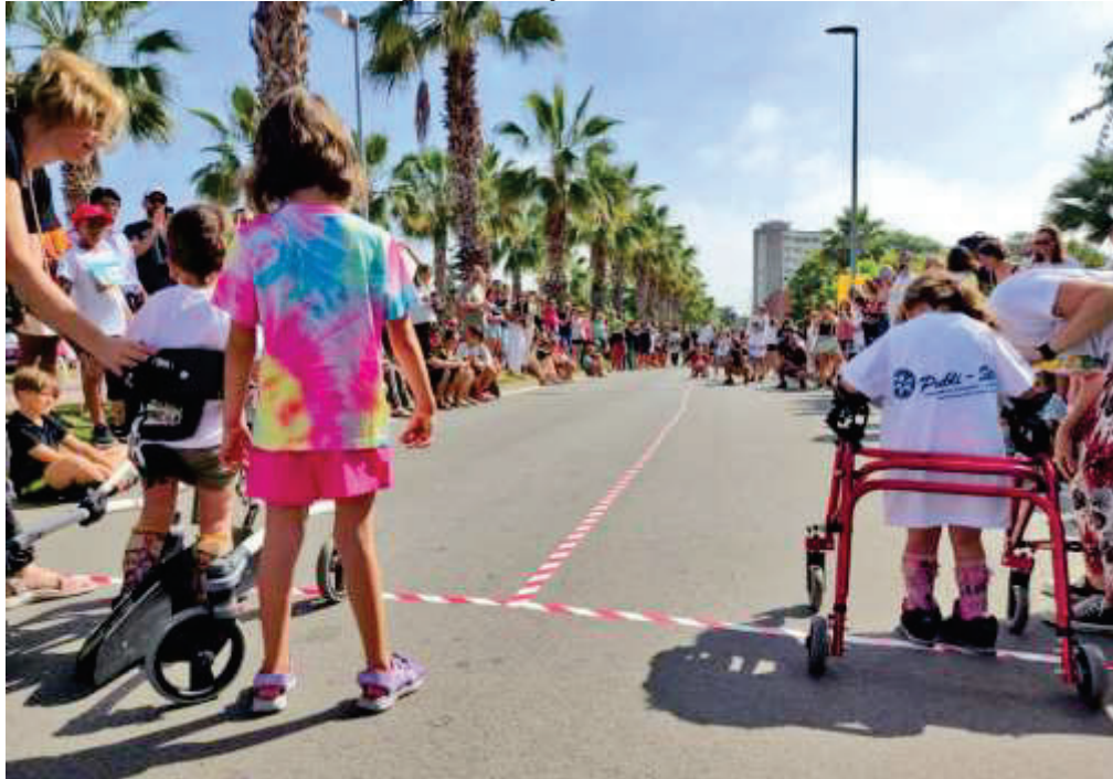
Figure 6. Adapted race of Vilassar