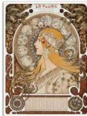
Figure 5: Calendar for La Plume in 1896.