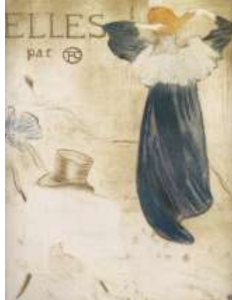
Figure 7: Poster for Elles from 1896.