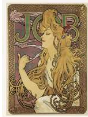
Figure 4: Poster for Job 1897.

Mucha received numerous commissions throughout his career for a wide range of products and services, including perfumes, cosmetics, theatrical performances, tourist services, and food. He undertook commissions for various countries and even toured the United States. In 1910, he returned to his native Czech Republic, where he is now regarded as one of the most renowned artists.