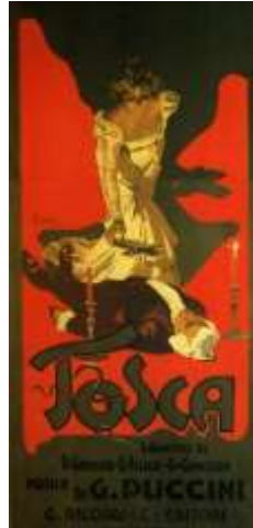
Figure 11: Poster for Tosca , 1899.