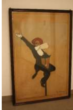
Figure 14: Sketch photograph for Campari, 1909.

Cappiello incorporated elements of humour and playfulness into his designs, employing saturated backgrounds that evoked an Oriental aesthetic, which had gained prominence in Europe through Japanese prints. His distinctive style was strategically leveraged by brands like Campari to enhance product recognition. Cappiello's fruitful collaboration with the company resulted in a long-lasting relationship, including the creation of a poster in its Arabic version for markets with restrictions on alcohol consumption.