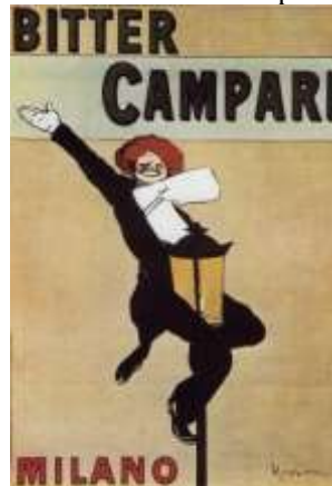
Figure 15: Poster for Campari 1909.