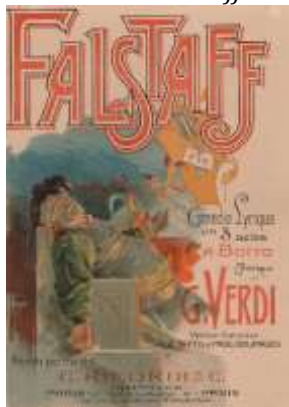
Figure 8: Poster for Falstaff from 1893.