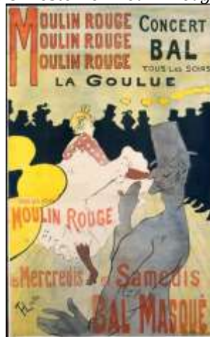
Figure 6: Poster for Moulin Rouge , 1891.

One of Toulouse-Lautrec's greatest innovations was his treatment of characters. He demonstrated remarkable skill in defining a portrait with as few strokes as possible, often incorporating a caricatural, ironic, and satirical element. These qualities, along with simple, smooth forms, were techniques that the artist could effectively employ in a poster but might not have been able to express within the conventions of painting at the time. The advertising medium offered him greater freedom, allowing for transgressive content that became highly appealing to the public of the era. Additionally, his posters exhibit innovations in composition influenced by photography, such as framing, the use of diagonal lines, and cropping parts of the human figure.