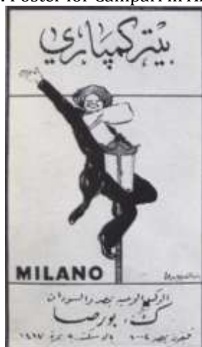
Figure 16: Poster for Campari in Arabic, 1909.