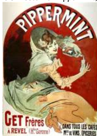
Figure 3: Poster for Pippermint , 1899.