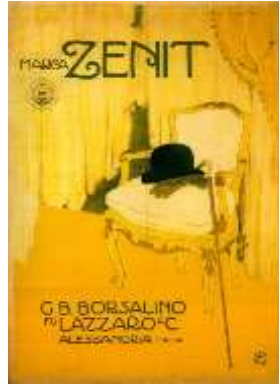
Figure 12: Poster for Zenit 1910.