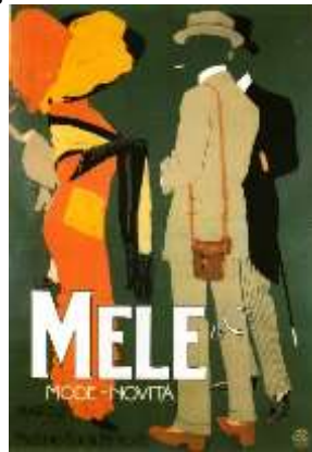
Figure 13: Poster for Mele 1910.

For Dudovich, stylisation and simplification serve as tools in a decorative game that combines humour and responses. The text, integrated into the design of the Liberty arabesque, gains the value of an image and achieves formal autonomy. His work straddles the border of abstraction without fully crossing it, yet it creates an advertising effect that transcends traditional codes while maintaining legibility. An outstanding example of this approach is his poster The Ghosts (1910) for Mele, where the hands and faces of the three characters fade against a green background. Although similar techniques had been previously explored by English poster artists, no one had dared to erase the faces to that extent until then.