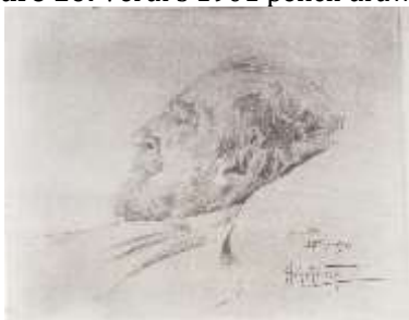
Figure 10: Verdi's 1901 pencil drawing.