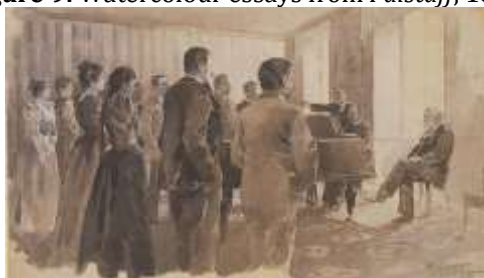
Figure 9: Watercolour essays from Falstaff , 1893.