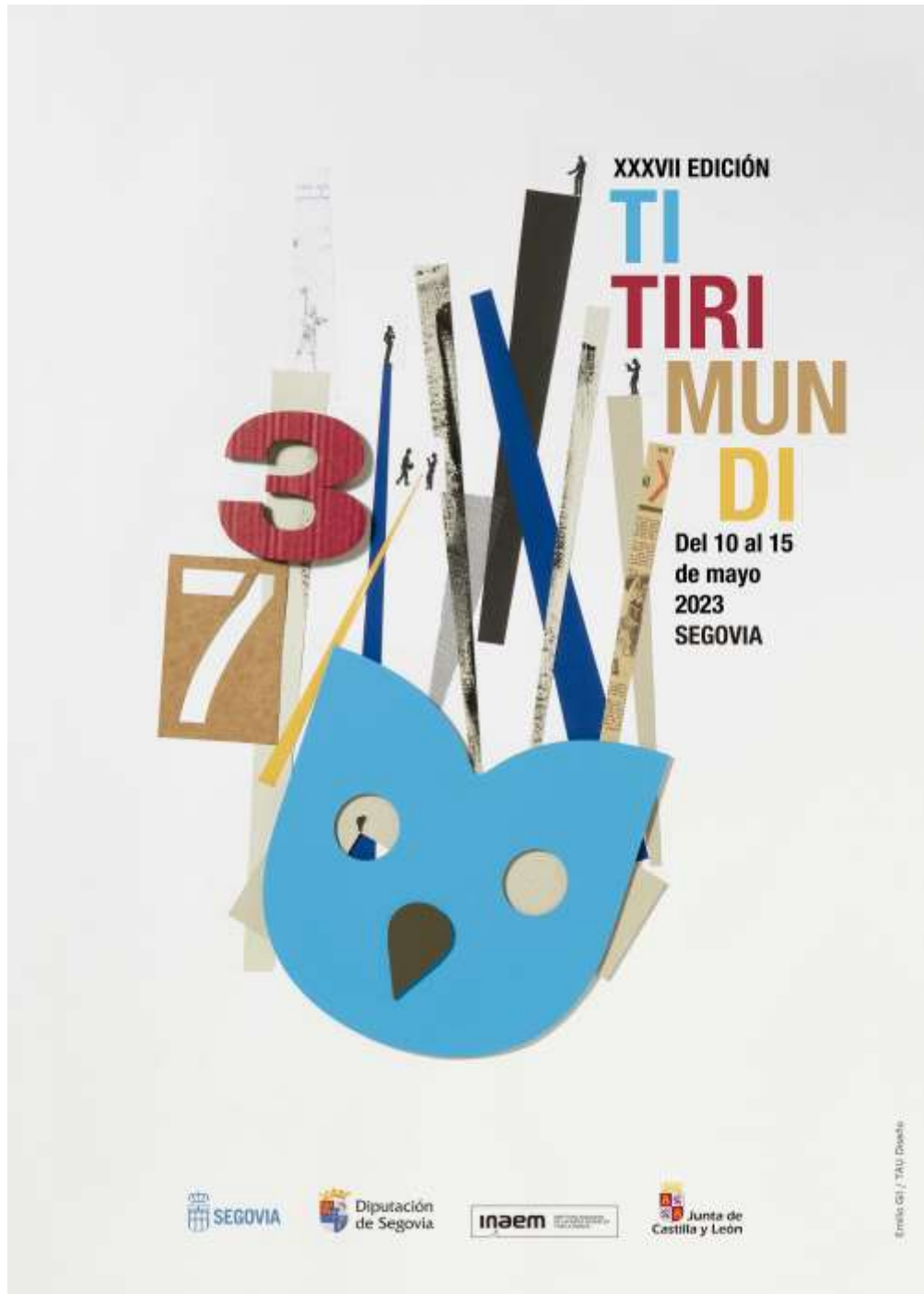
Figure 7: 2023 Titirimundi poster

This poster, created by Emilio Gil, centres on the puppet and its expression as the dynamic axis, emphasising the importance of both the spectator and the puppeteer within the festival and, consequently, within the poster. It also evokes the city and its surrounding environment.