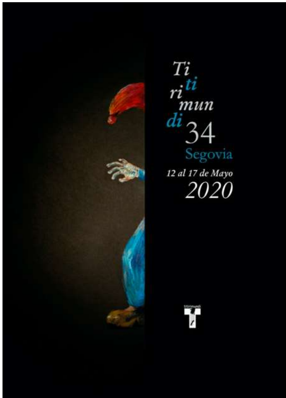
Image 4. 2020 Titirimundi poster