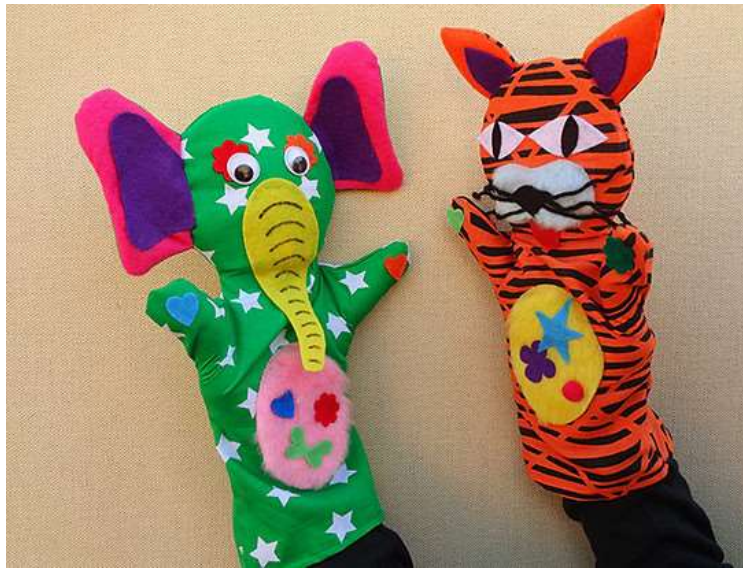
Figure 2: Image of a hand puppet