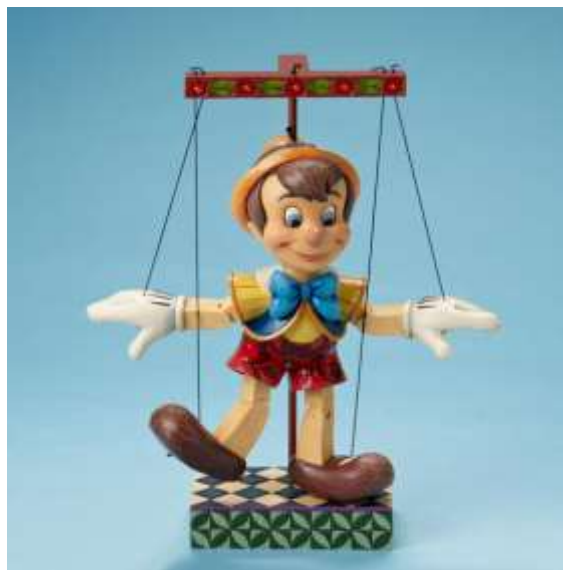
Figure 1. Image of a marionette puppet

Marionette: A figure created and manipulated primarily by strings attached to its upper parts. The strings are fixed to the sections intended for movement, and it is the puppeteer who designs the character's movements in order to convey the intended interpretation. These are often unique, creative pieces invented by the performer.