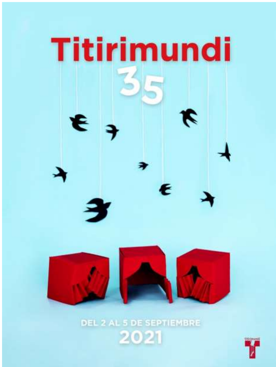
Figure 5. 2021 Titirimundi poster