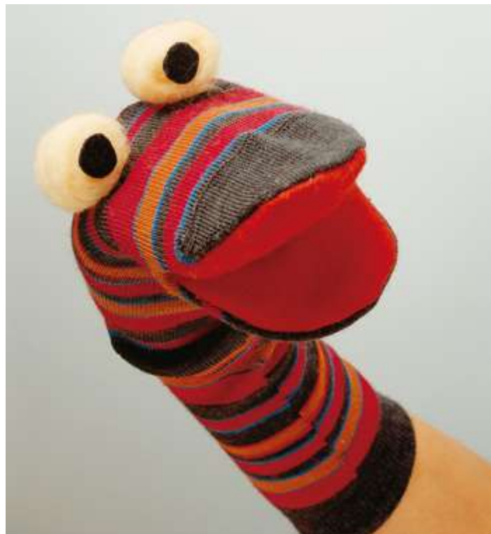
Figure 3. Image of a glove puppet

Glove puppet: This puppet is the figure from which the term 'puppets' is derived. It is the simplest to create and is manipulated primarily by the hand inserted inside the figure, much like a glove. It is characterised by its ability to move the mouth. Typically, the thumb controls the lower jaw, while the other fingers control the upper jaw. This puppet is commonly sold in toy shops, facilitating wider access to puppet culture within households.