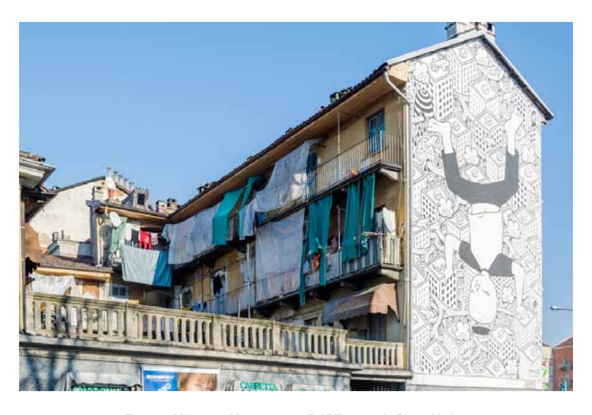
Figure 3. Millo, c.so Vigevano n. 2. B.ART 2014.