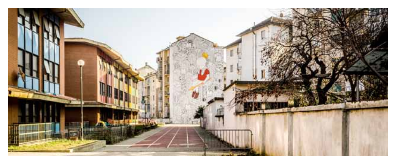
Figure 4. Millo, via Cherubini n. 63. B.ART 2014.