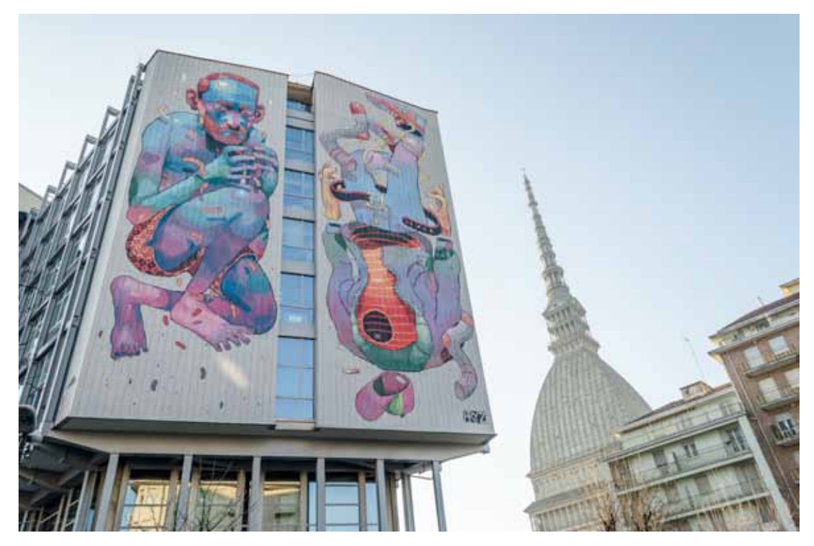
Figure 2. Aryz, Cso. San Maurizio, PicTurin 2010.