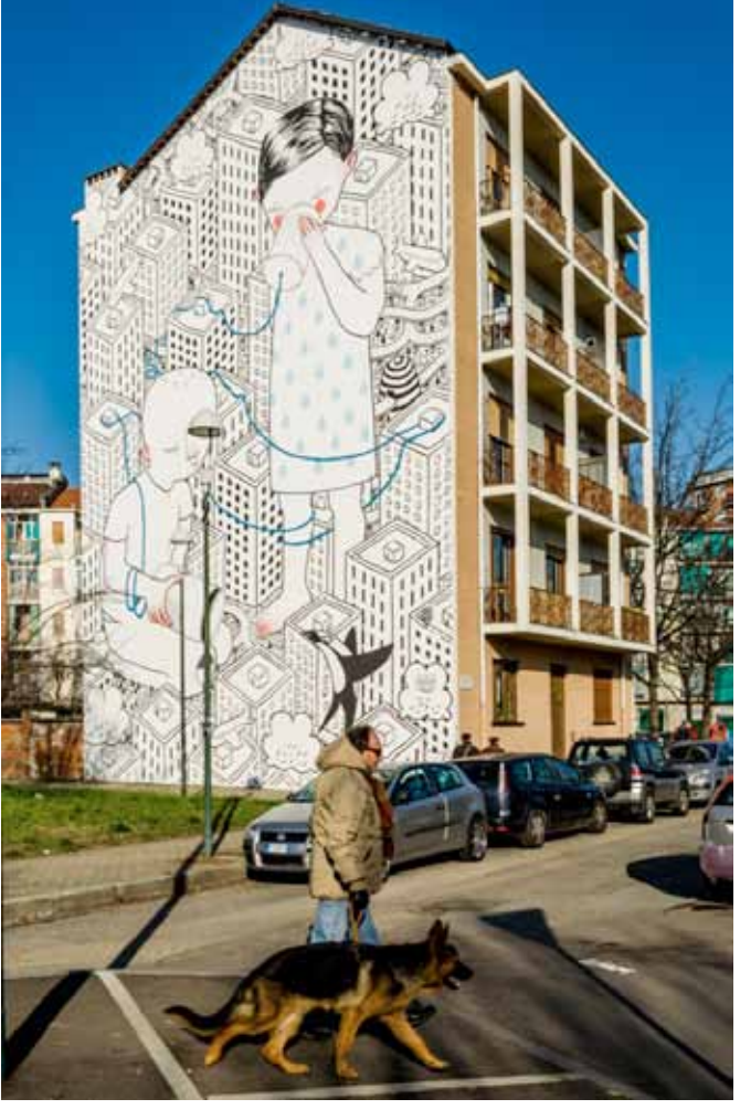
Figure 5. Millo, via Cruto n. 3. B.ART 2014.