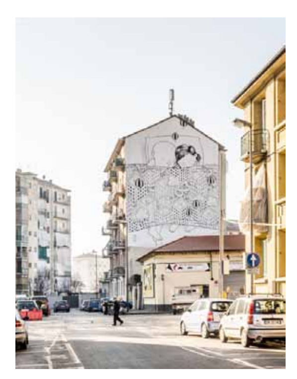
Figure 5. Millo, piazza Bottesini n. 6. B.ART 2014.