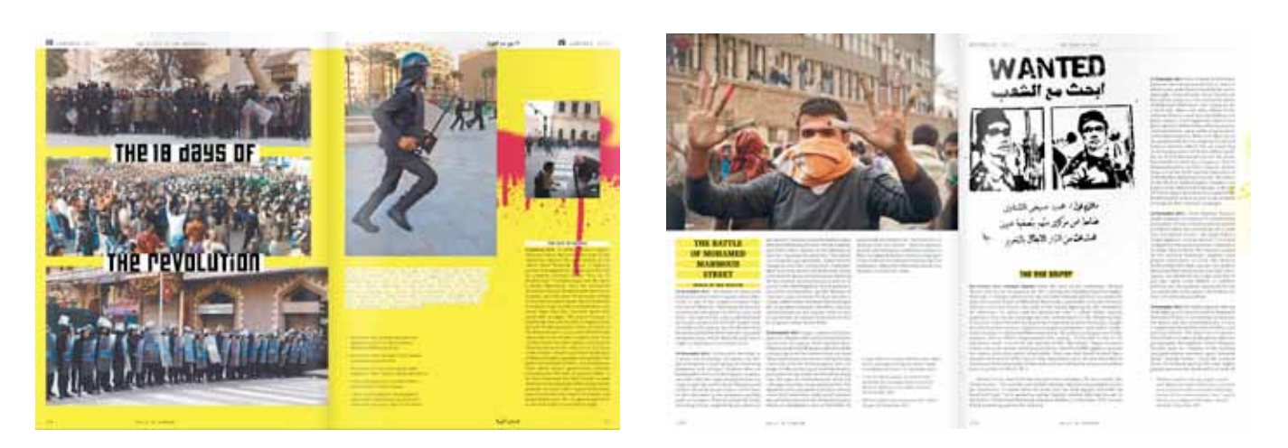
Figure 5 and 6 Two Spreads from the book showing the structure of the timeline, quotations, captions and short texts and how they vary stylistically to ensure clarity for the reader. For a more detailed live preview, see: http://issuu.com/fhtf/docs/ wof teaser

Shortly following the publication of the book, a shipment containing 400 copies was confiscated in Alexandria by Egyptian authorities for allegedly 'inciting violence.' This was later announced as a misunderstanding by authorities