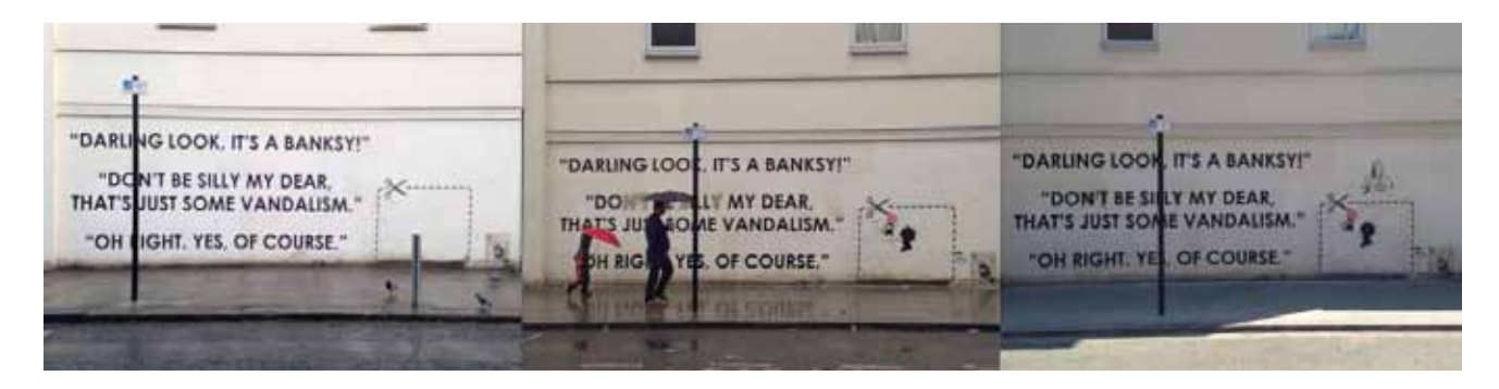
Figure 2. Whymark Avenue, London. May 2014 - April 2015.

tween the panda's ears, mocking its status as a work to be revered; and the block-lettered, "FREE ART NOW!" along the panda's right arm, adopting the format of a political slogan to refer to the wrongfully 'captured' Banksy, and perhaps also to the unethical commodification of street art gifted for 'free' to the community.