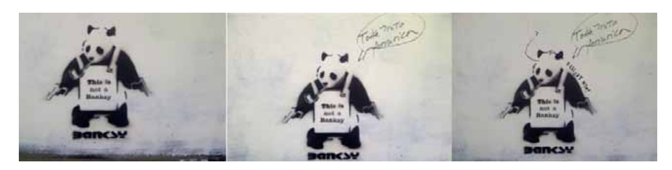
Figure 1. Whymark Avenue, London. April 2013.

Daily longitudinal photo-documentation of the wall allowed us to capture the additions subsequently made to this work by members of the public. Following the next turn proof procedure, we can approach these additions as contributions that show these authors' understandings of the prior works on the wall. The morning after the panda stencil appeared, a passerby scribbled "Take me to America" in a speech bubble above the panda's head (see Frame 2 of Figure 1). This projected speech has particular resonance in the relatively socio-economically deprived context of the neighborhood where the work is located: few local residents would have the means to travel to America. This contribution thus marks Slave Labour's transatlantic journey to an auction house in America as in some sense enviable, but perhaps also out of