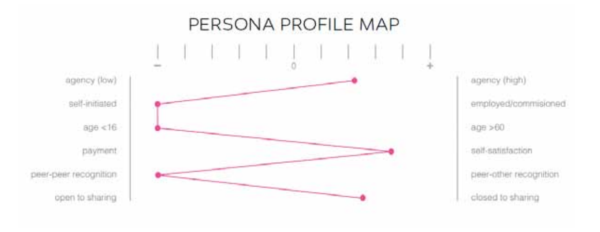
Figure 4: Persona 3 - Mr X. 15, Graffiti writer. UAL (Graffolution, 2015)

The aim is self-recognition and peer-to-peer recognition. The crew is fundamental and he holds the more closed position to sharing.