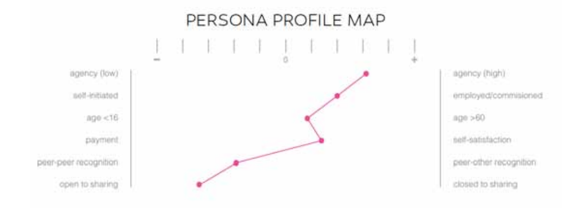
Figure 2: Persona 1 - Mark, 35, Artist. Toylan, UAL (Graffolution, 2015).

Beyond any regional cultural, social, historical etc. differences, the personas work to reflect personal features which repeatedly proved to surface as common and significant among different graffiti related interviewees, and which proved notably different in other cases. After the whole iteration process, three main trends or profiles were found. The organisation of the personas is made around their social and demographic background, their relationship with graffiti (background, practice, risk & efforts), their view on legal practice and prevention and future vision. According to these criteria, three persona profiles have been found and are described below.