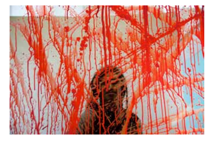
Fig. 25. Animatism, Melbourne, Australia, July 2014.

As a collective, Animatism drew on our individual creative voices to deliver the 2014 Gertrude Street Projection Festival Judge's Prize, merging our video interests - as both art form and documentary device<sup>14</sup> - into a presentation that captured our practice, collaboration and conceptual intent, integrating our final video into a 20 foot mural.