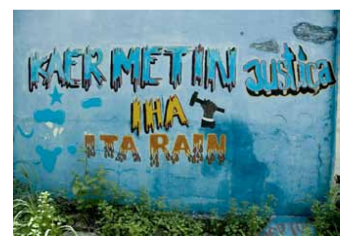
Fig. 5. Comoro, Dili, East Timor, March 2008.<sup>6</sup>