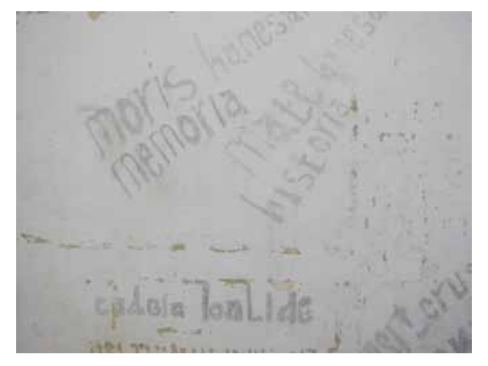
Fig. 11. Balide Prison, Dili, East Timor. March 2008.