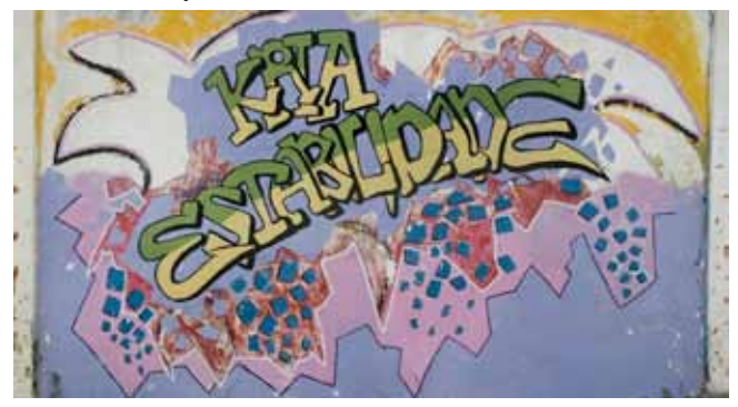
Fig 8. Comoro, Dili, East Timor, March 2008.