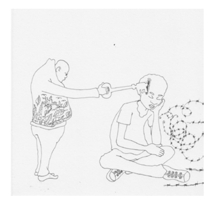
Fig. 26. Animatism, Melbourne, Australia, July 2014. Image: Alfe Perreira. Used with permission.

containers have been used across the country for emergency response and innovative, crisis-led housing in addition to being an ongoing resource for the shipping of aid and assistance between Australia and East Timor.