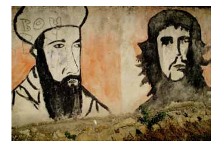
Fig. 3. Bemori, Dili, East Timor, August 2006, East Timor, Image: Chris Parkinson.<sup>4</sup>