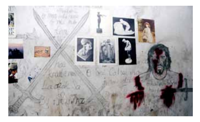
Fig 13. Atauro, East Timor, April 2008.<sup>10</sup>

9 - Image appears in Parkinson, C. (2010) Peace of Wall: Street Art from East Timor, Affirm Press, Melbourne, pg 88.