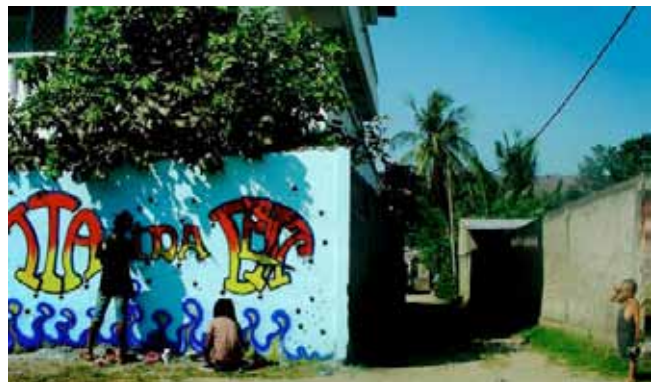
Fig. 7. Bemori, Dili, East Timor, August 2006.<sup>7</sup>