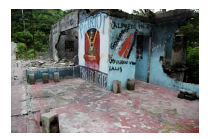
Fig. 10. Becora, Dili, East Timor, March 2007.

Whilst aspirational works multiplied, so too did works that painted a more complex picture of East Timor's reality. Impassioned sedition countered East Timor's public projection, bringing to the public eye a posturing of the streets that demonstrated political allegiance, ethnic identity and the fundamental frustrations of subsistence.