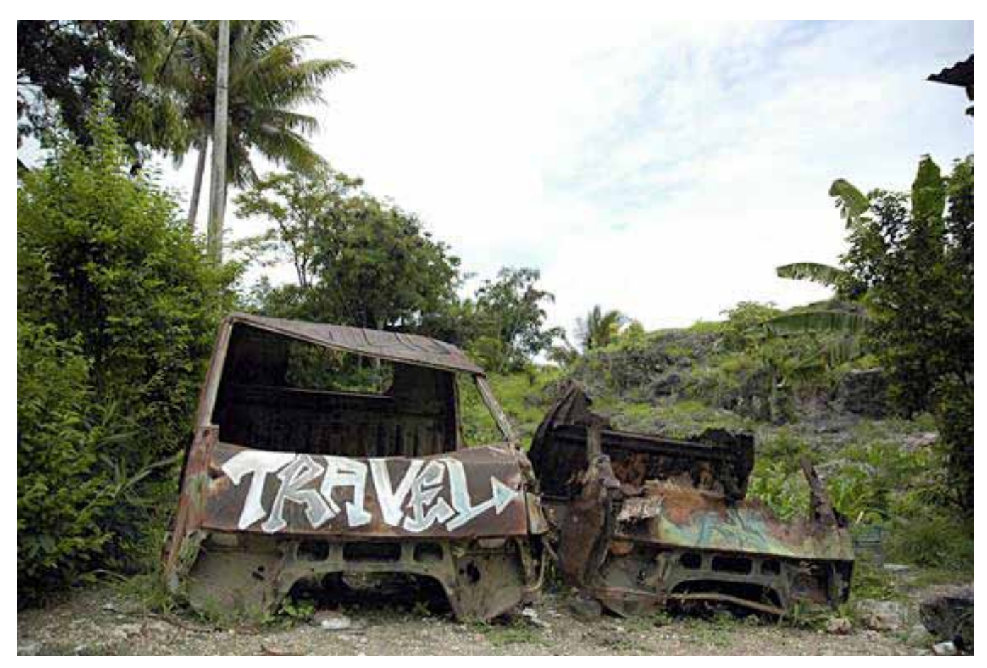
Fig.2. Baucau, East Timor, December 2007.