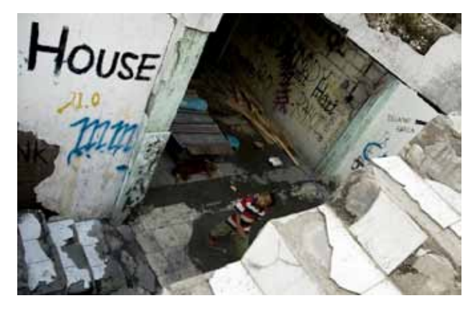
Fig. 12. Bairo Central, Dili, East Timor, April 2008.<sup>9</sup>

The lineage of East Timor's graffiti suggests a flipped perspective of contemporary understandings of graffiti as an act performed in the public sphere. In East Timor, some of the most powerful examples of its graffiti occur in the private sphere, hidden transcripts illuminating the struggle inherent in the cycle of resistance and recuperation. The vestige of Indonesia's scorched earth policy, however, very literally removed the walls that delineate the private from the public, developing an interstitial space where these voices spool into public focus. John Schofield likens graffiti, in a heritage context, to an "alternative archeology, or alternative geography, creating a documentation of interstitial places, the social meaning of which is confined to certain (often excluded) groups in society." (Schofield, 2010, p 78).