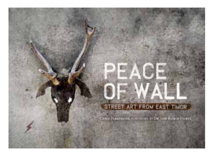
Fig 18. Peace of Wall Book Cover, May 2010.

When Peace of Wall was published in 2010, little could I predict the momentum that would ebb and flow over the next five years, consistent with an idea of artistic research and creative practice where "relations between different modes of knowing which, though in dialogue...are not subject to commensurate criteria of validity but which might affirm each other by way of resonance" (Nelson, 2013, p 58). Upon its release, Peace of Wall was described as "an evocative piece of photojournalism - capturing an important moment in East Timor's history through its walls... this book alerts us to the cultural value of graffiti and street art for public expression, rehabilitation and community building... This is not a typical "Graffiti" book – it is more focused toward understanding the community and the way it expresses its concerns and dreams" (Manco, 2010).