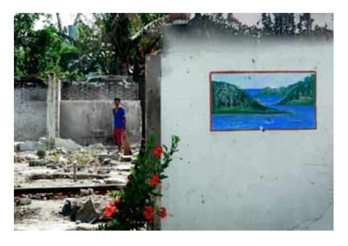
Fig. 4. Balide, Dili, East Timor, November 2006.<sup>5</sup>

4 - Image appears in Parkinson, C. (2010) Peace of Wall: Street Art from East Timor, Affirm Press, Melbourne, pg 28.