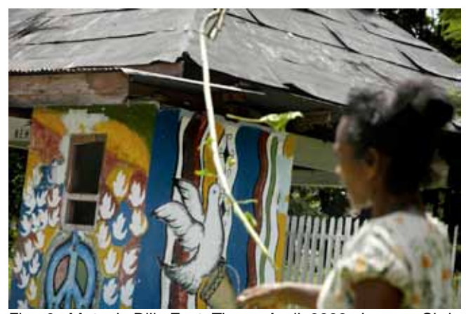
Fig. 6. Motael, Dili, East Timor, April 2008.