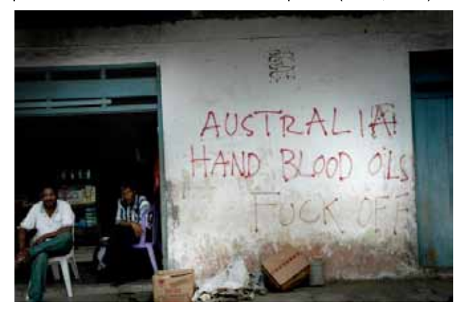
Fig. 9. Suai, East Timor, December 2007.<sup>8</sup>

Conflicting with this proliferation of peace, however, spooled the formerly hidden articulations of the population, directly and publicly responding to a complicated local and geopolitical context mired in the teeth of power (Scott, 1990).