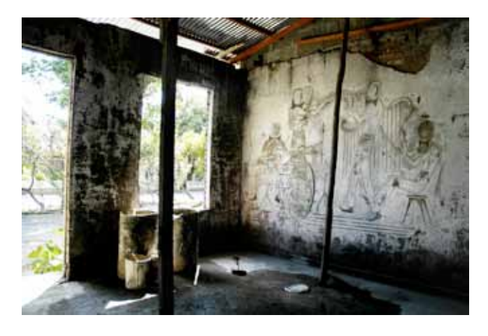
Fig. 14. Bidau, Dili, East Timor, May 2008.<sup>11</sup>

This interstitial space is an important one in the context of East Timor's cultural heritage.