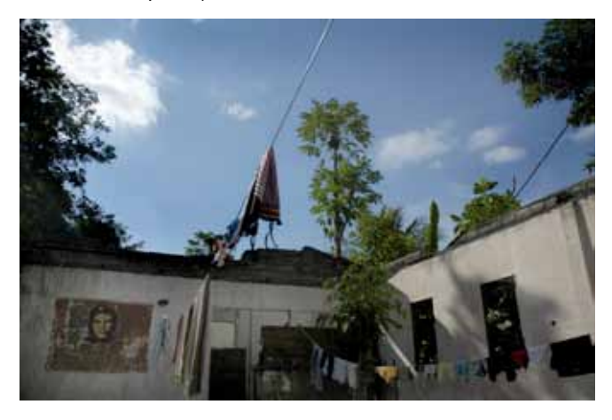
Fig. 15. Taibessi, Dili, East Timor, July 2007.

Graffiti's capacity to relate the biography of the ruin as something more than a vestige, but as an active account and witness to lives unfolding, transfigures East Timor's "unintentional or 'immanent' cultural heritage landscape – consisting of the unrestored wreckage of houses and buildings burned or damaged by departing TNI and their militia in 1999," (Leach, 2009, p 156) into an aesthetic realm through the "objective discovery of the new within the given, immanently, through a regrouping of its elements."(Buck-Morss, 1977, p 132).