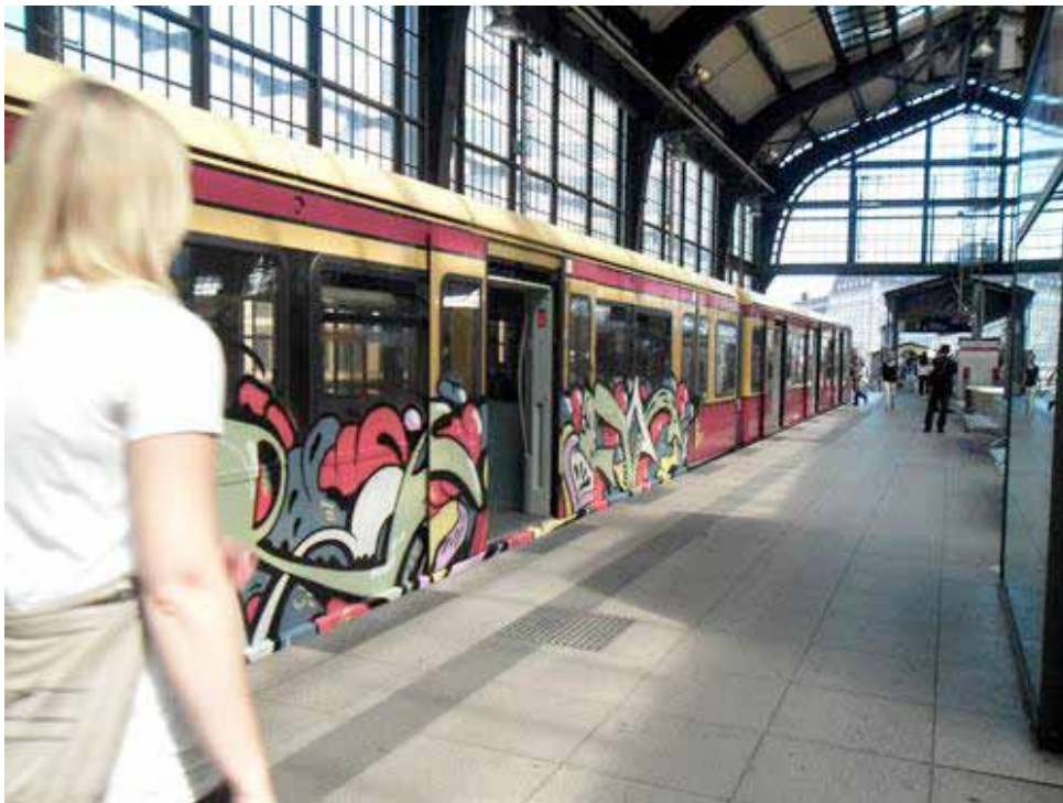
Fig. 5: An operational public transportation train with graffiti art in Berlin, Germany.

Photo: 09 June 2017, Prague Main Railway Station. Google Maps: 50.084272, 14.436547.