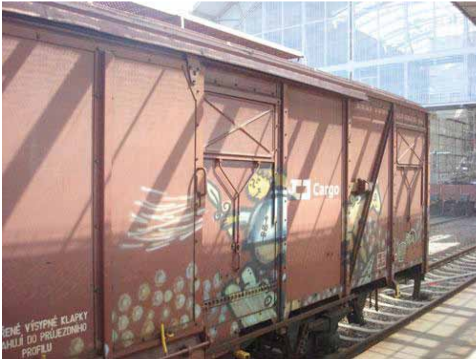
Fig. 4: A cargo train with graffiti art in Prague, Czech Republic.

Photo: 09 June 2017, Prague Main Railway Station. Google Maps: 50.084272, 14.436547.