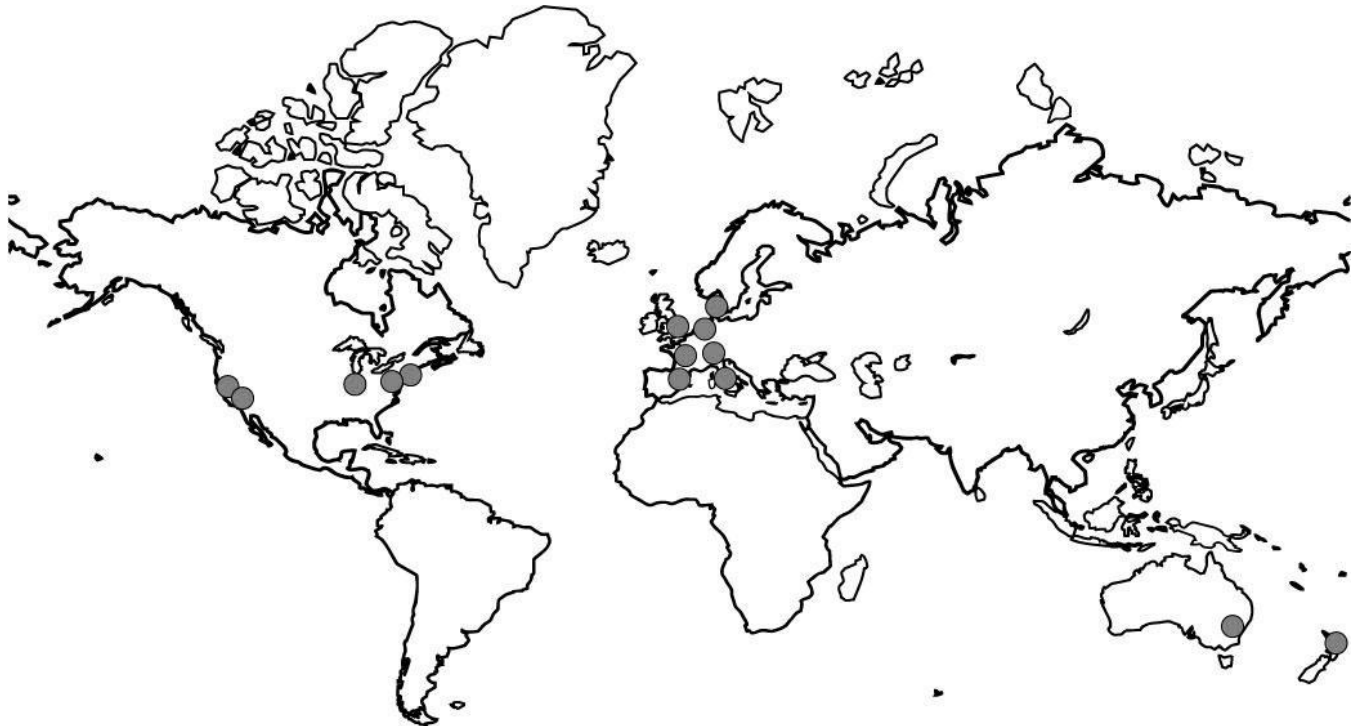
Fig. 2. In 1987 the publication Spraycan Art featured graffiti art works from the following cities: New York City, Philadelphia, Pittsburg/Cleveland, Chicago, San Francisco/Bay Area, Los Angeles, London, Bristol, Wolverhampton, Amsterdam, Eindhoven, Paris, Barcelona, [West] Berlin, Brühl, Vienna, Copenhagen, Sydney and Auckland.