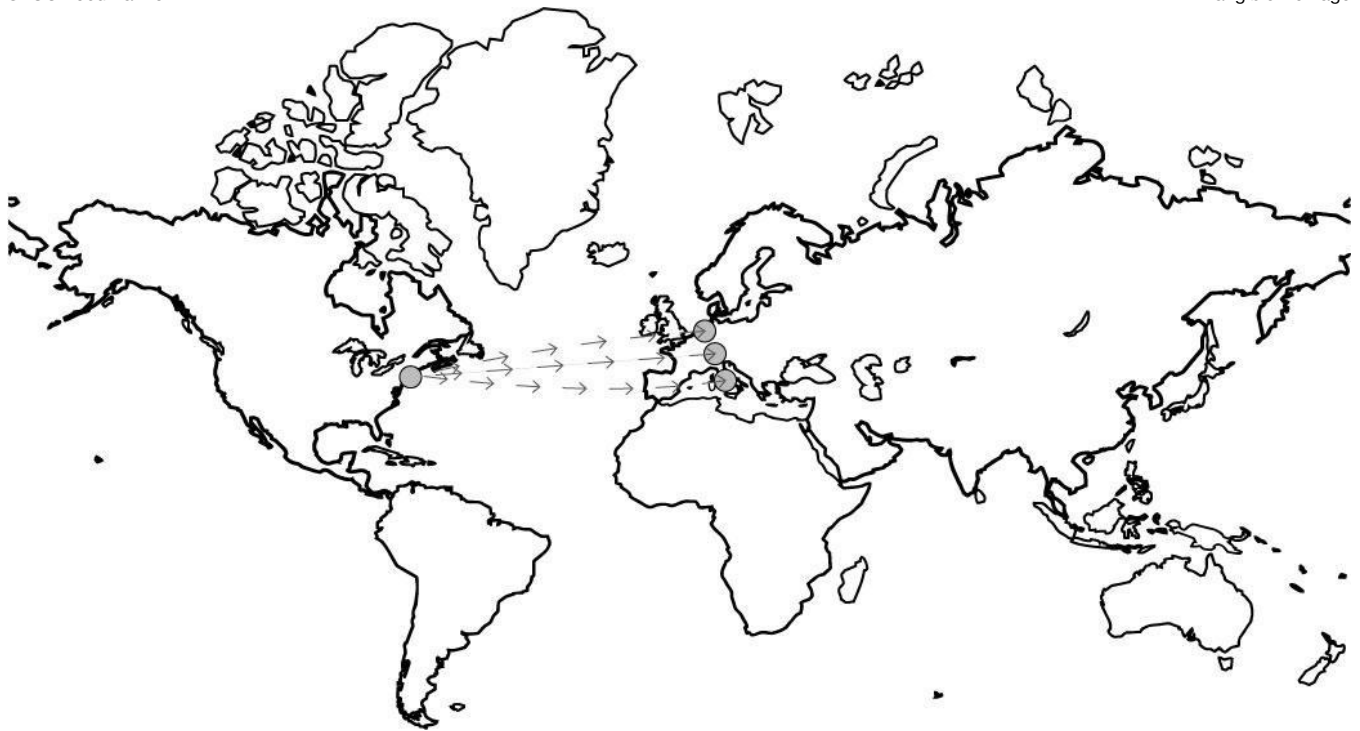
Fig. 1. Dissemination of the graffiti art culture from New York City to Western Europe in early 1980s. Gallery exhibitions of New Yorker graffiti artists in Western Europe, a printed publication and motion pictures about graffiti art as part of a wider hip-hop culture played major roles in the transnational dissemination.