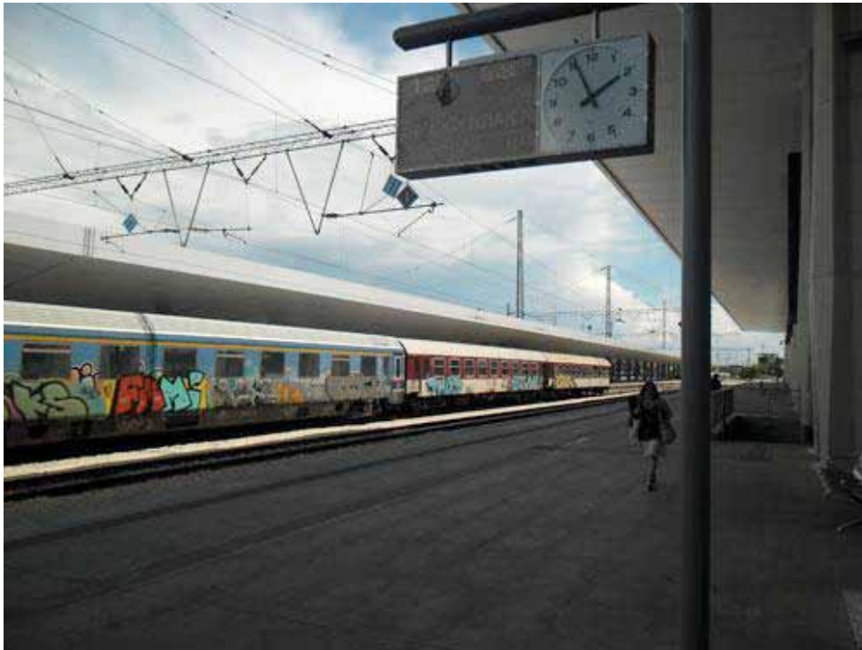
Fig. 6: An operational intercity train with graffiti art in Sofia, Bulgaria. Photo: 04 June 2016, Sofia Cenral Station. Google Maps: 42.712871, 23.319797.