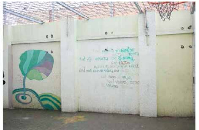
Fig. 4. Earlier inspirational murals in an isolation unit