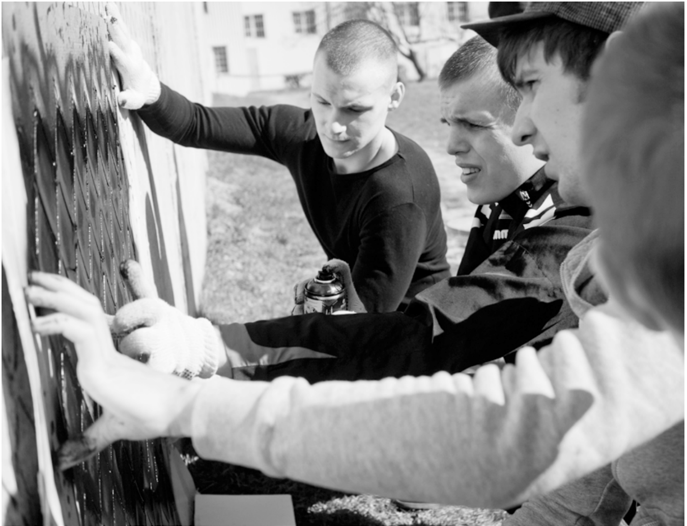
Fig. 8. Young offenders learning stenciling techniques with Zacharevic

The second recreational area was co-produced with the artist Ernest Zacharevic. The young offenders engaged with the production of this work assisted the artist and learned stenciling techniques in the process.