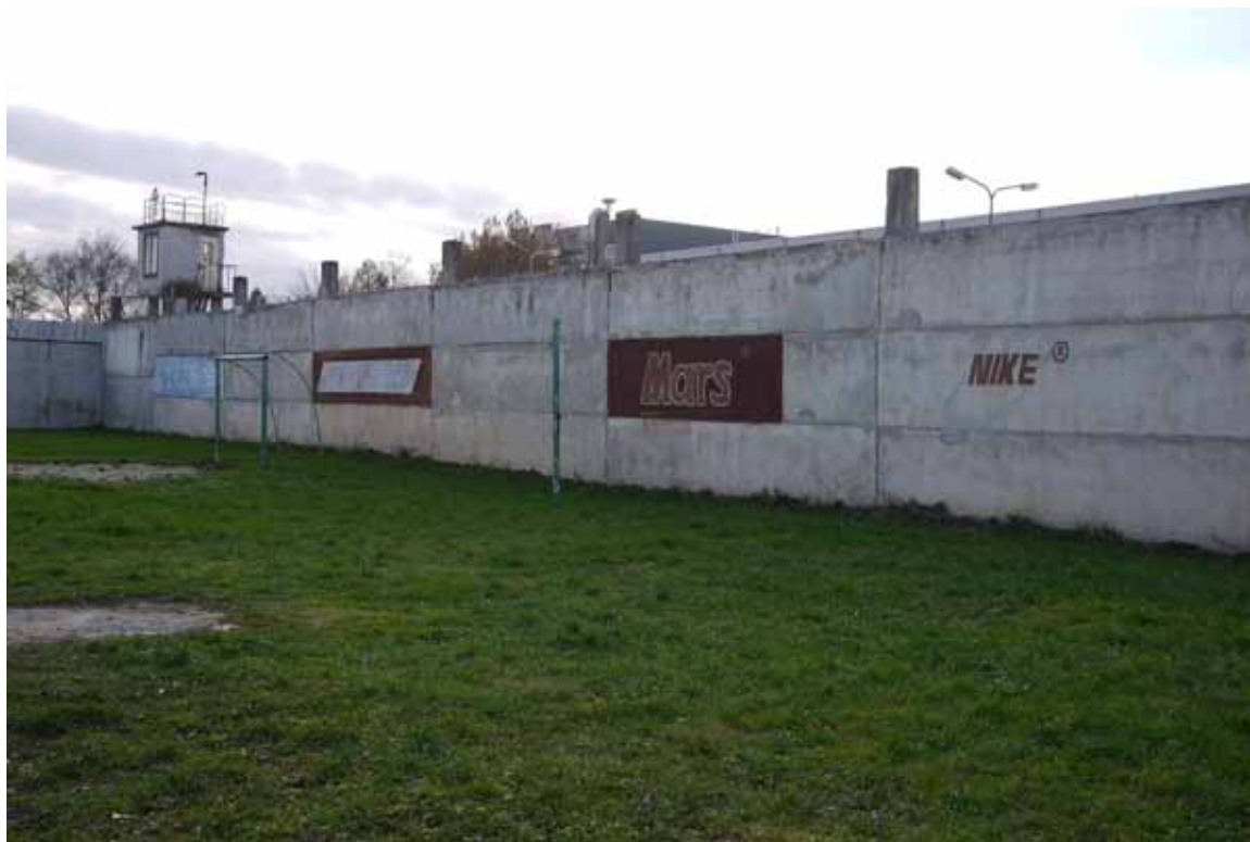
Fig. 2. Post Soviet-era mural showing newly available brands