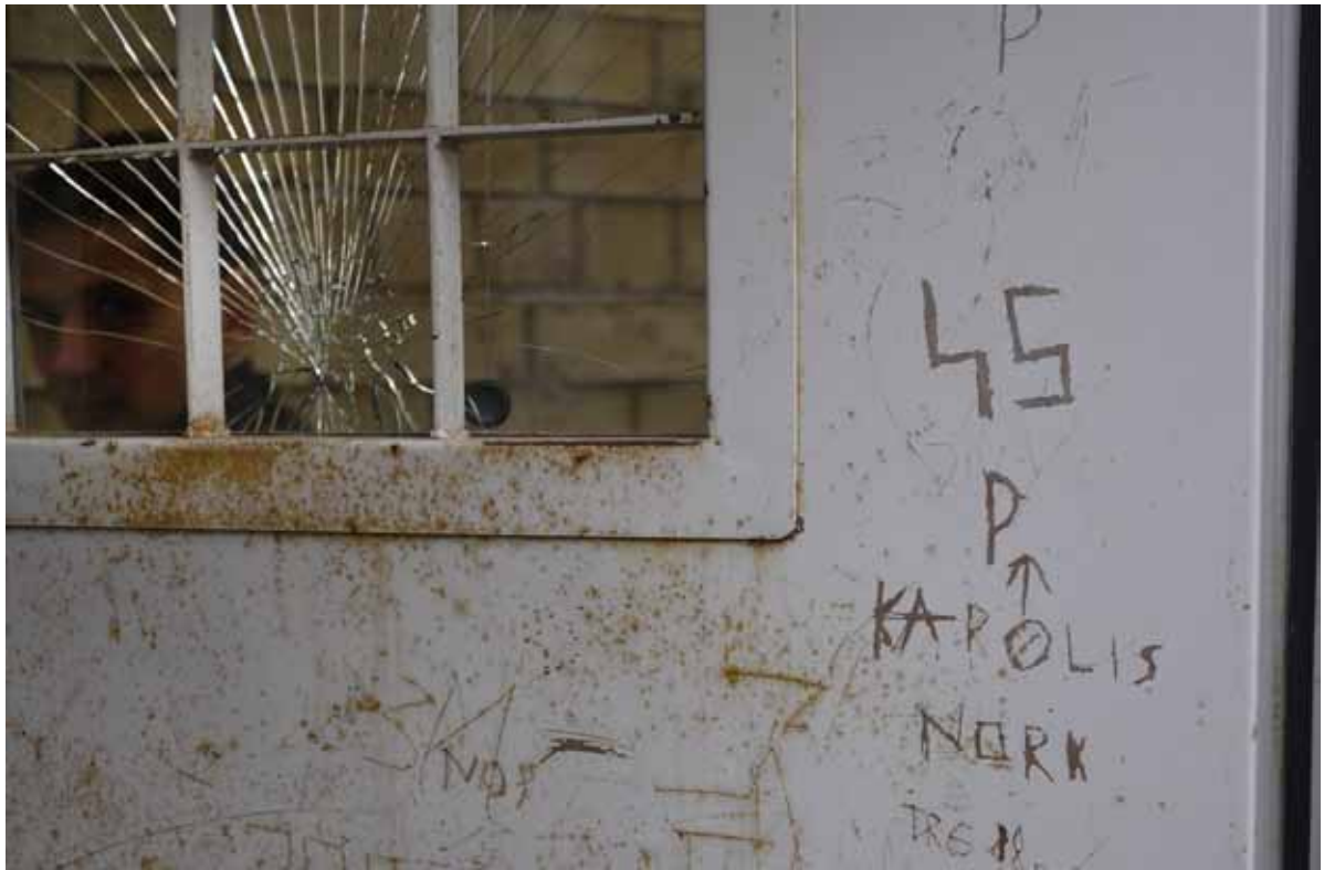
Fig. 3. Internal door of isolation unit