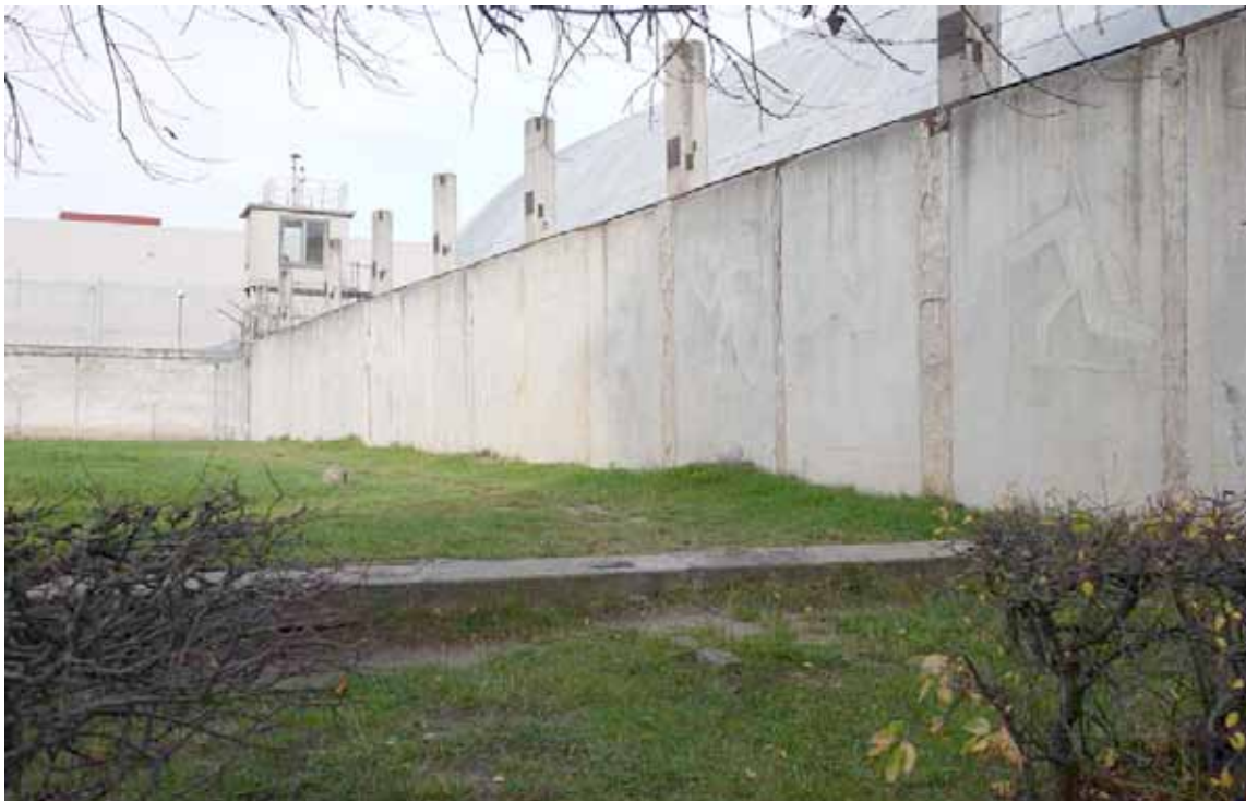
Fig. 1. Soviet-era mural featuring sporting pictograms