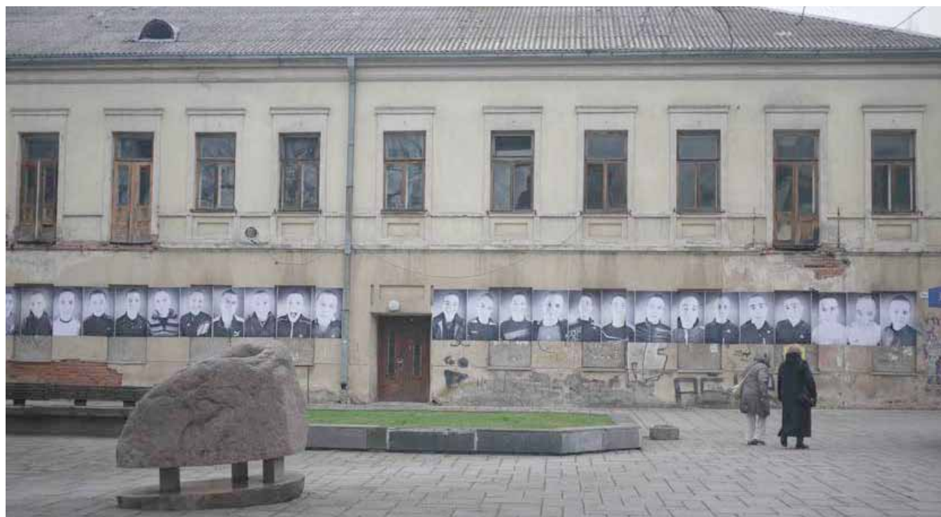
Fig. 10. The Recreation Area 1 wall mirrored on Kaunas Former Police Headquarters