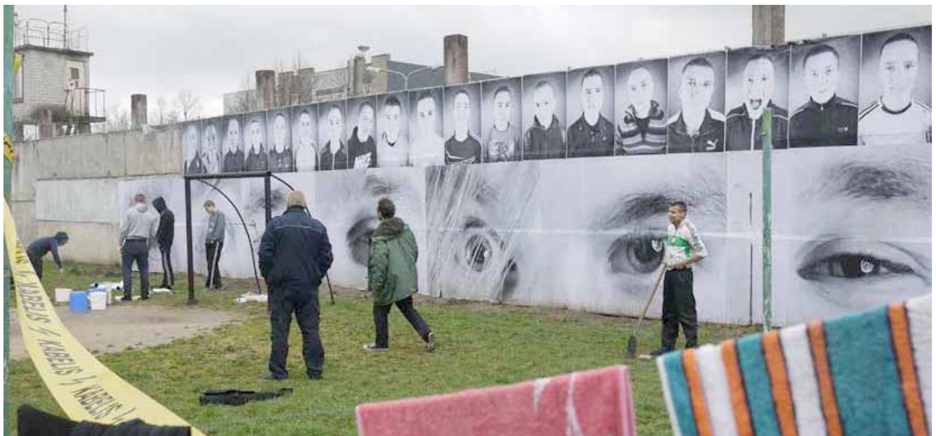
Fig. 7. Co-producing the wall in Recreation Area 1

The order of the groupings in which the photographs appear reflects the young men's own acknowledgement of both friendships and hierarchical social networks within the correctional facility (see Figure 7, below).