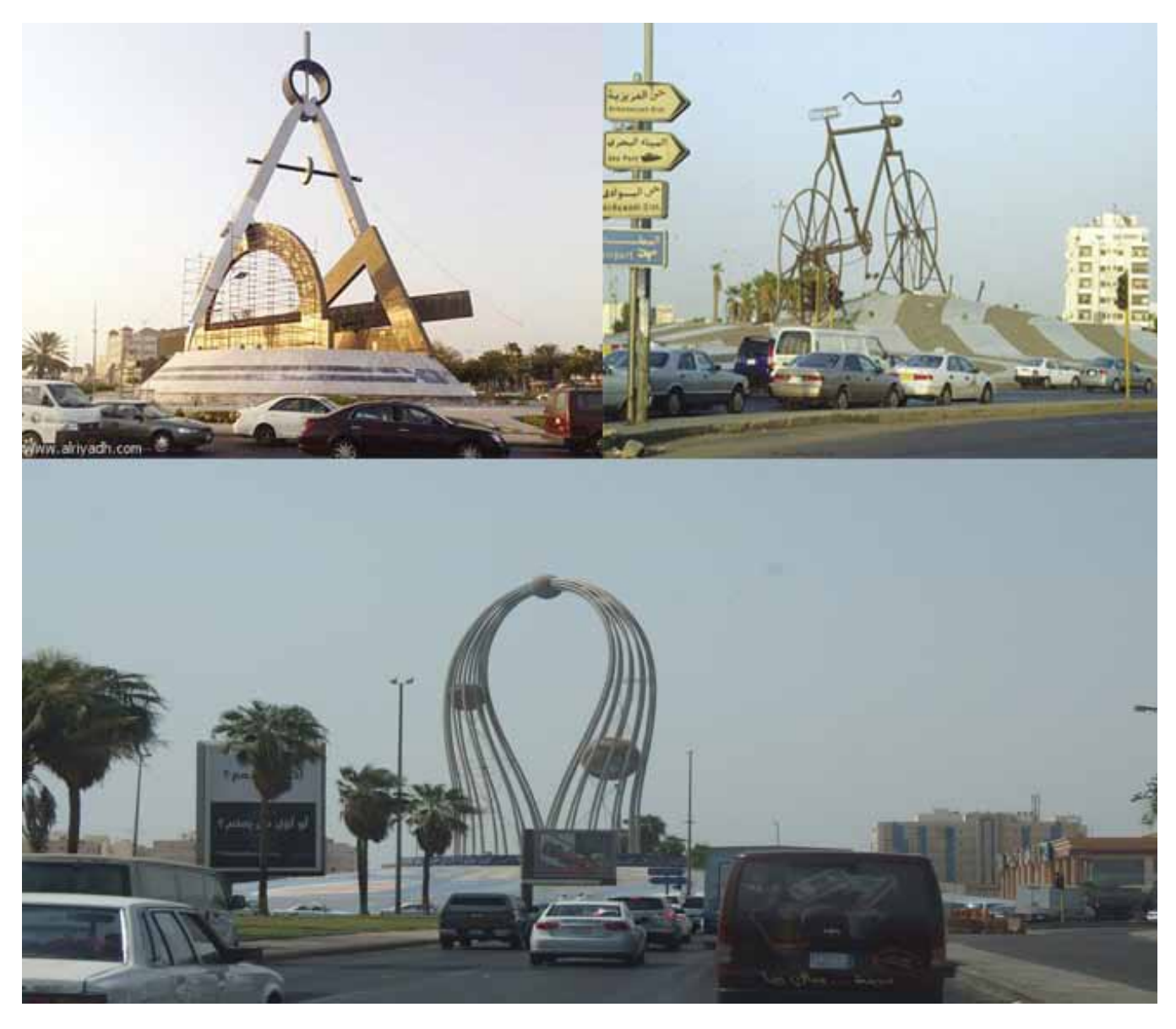
Fig. 3. Public artworks as urban landmarks in Jeddah. Above right: Al-Handdassa roundabout, above left Al-Darraga roundabout, Below: Al-Falak, roundabout