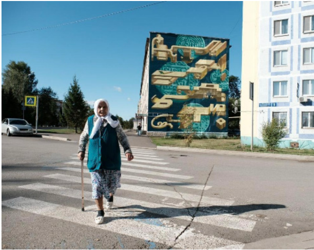
Figure 10 Kreemos (Podolsk). Be Happy! 2018.

The work of the Greek artist Ficos is inspired by the Tatar fairy tale about the golden bird, where the hero (batyr) fights and defeats an ophidian adversary (Azhdaha) (Fig. 8, 9).