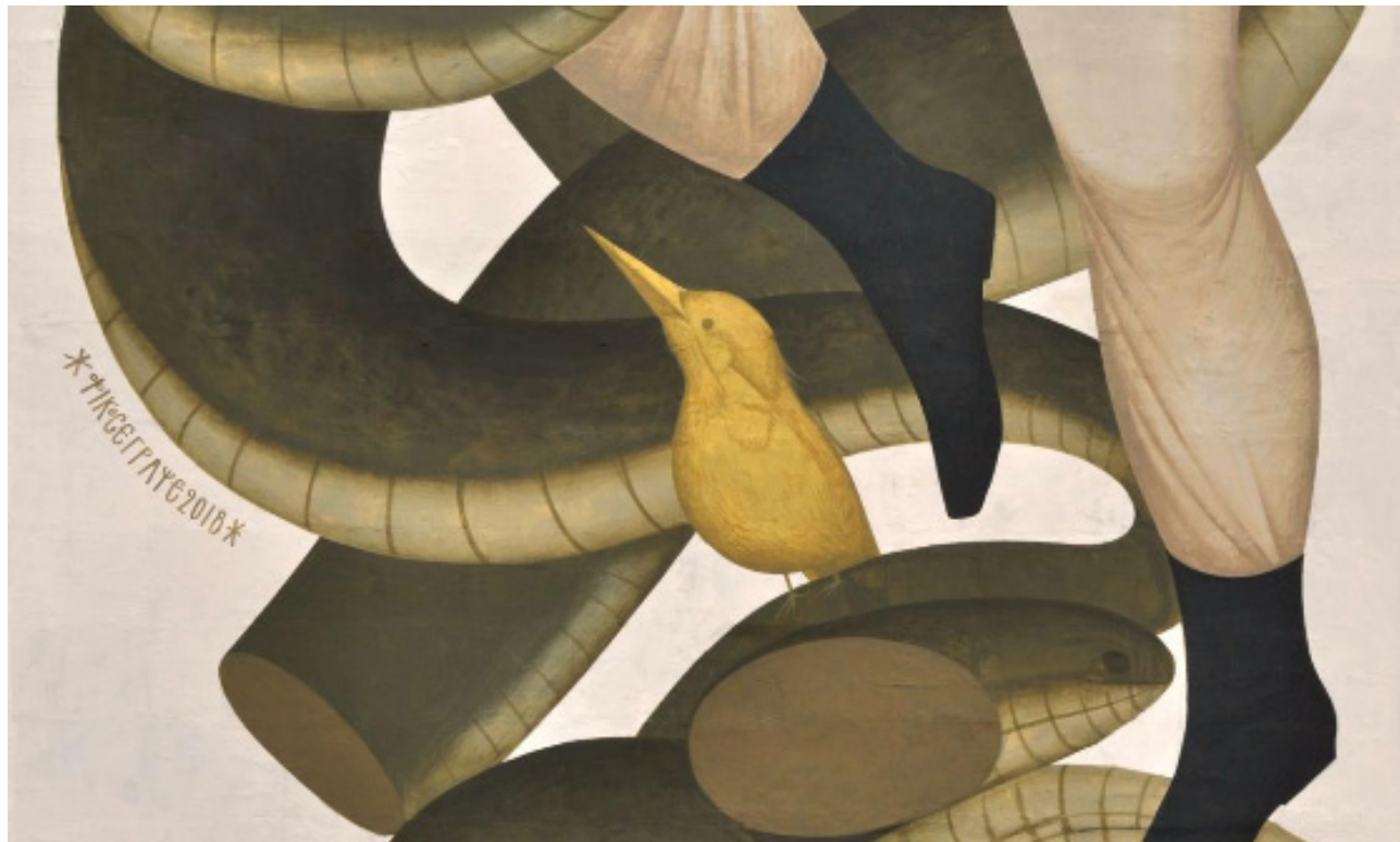
Figure 8, 9 Fikos (Athens). The Guardian, 2018.