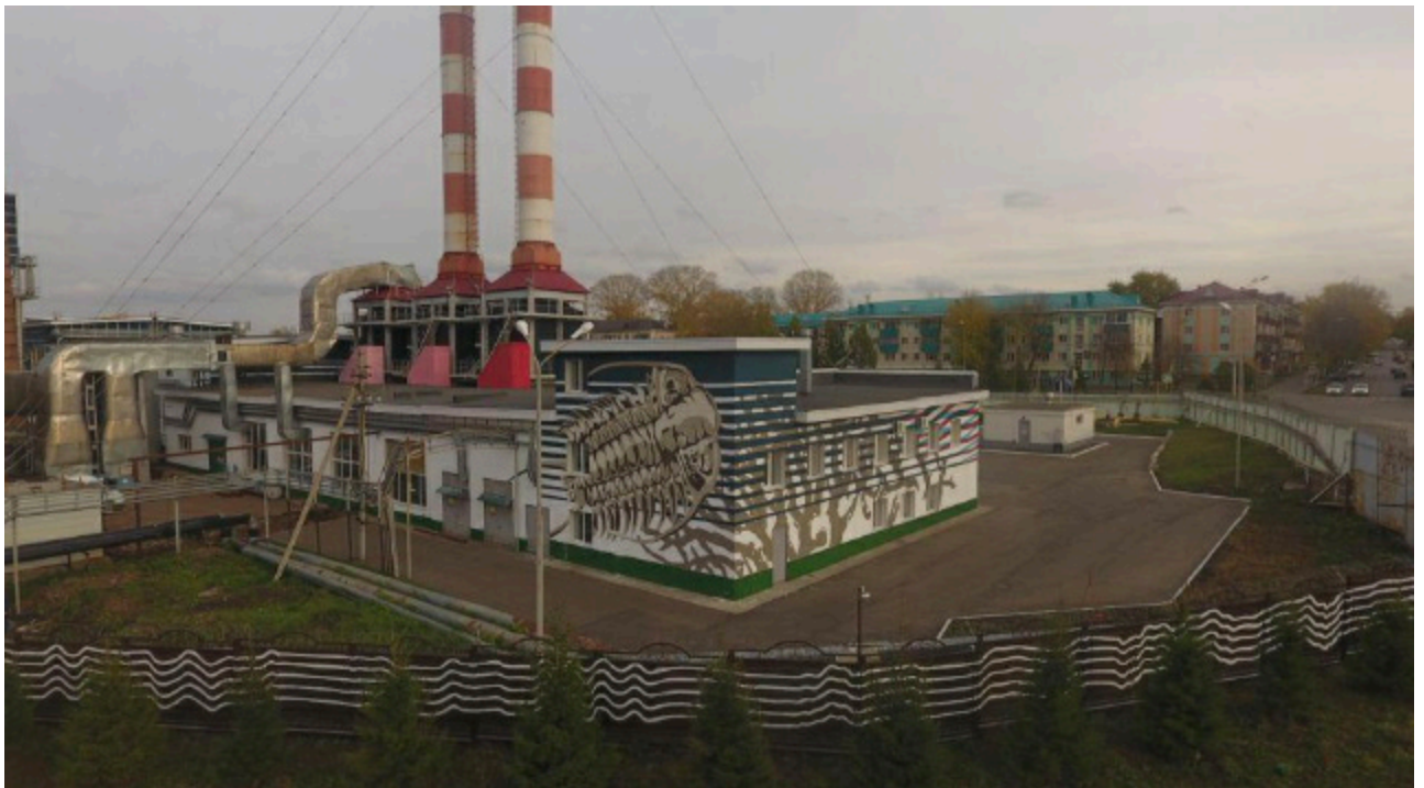
Figure 3, 4 Artem Stefanov (Moscow). Theories of Oil Genesis, 2018.