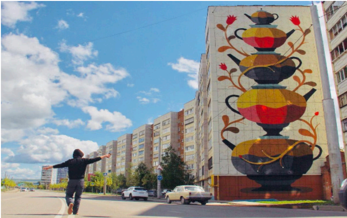
Figure 1 Agostino Iacurci (Berlin). Five Teapots, or Isanmesez, 2017.

The heroic work of oil production, along with the fairy tale of the golden apples is embodied in the painting the Gold of Tataria by Haris Yakupov and depicted in "The Land" mural (Fig. 2).