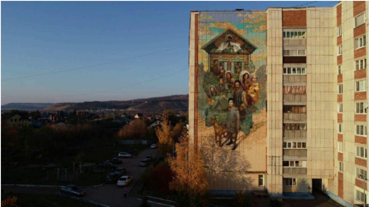
Figure 5 Basil LST (Irkutsk). Nadyr Urazmetov. Heritage, 2018.

According to survey respondents there are several theories of the origin of oil: the organic theory: oil occurs when sediment-containing layers of organic matter reach the so-called “oil window”: that is, several kilometers underground, at high pressure and temperatures; inorganic theory: oil come from deeper layers, for example, condensing from rising gas fractions; space theory: oil was brought to Earth with meteorites (Fig. 3, 4).