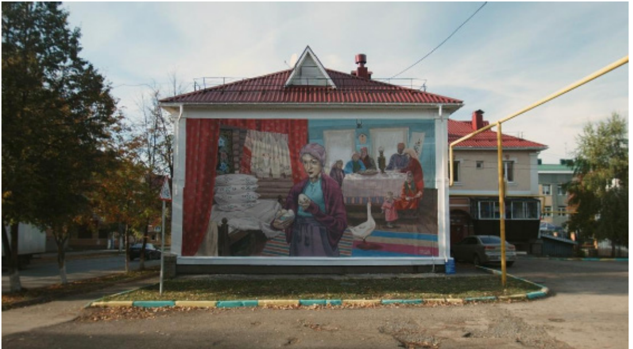
Figure 11 Dimitris Taxis (Athens). Dinner, 2018.

The image of a traditional Tatar house includes depictions of both interior and exterior portions. Integral parts of the exterior are thatched roofs, front yard, greenery and flowers, bright colors of the house paint (various shades of blue, green, yellow, white, brown), ornaments and open-work window decorations. Every house necessarily kept a vegetable garden and orchard (apples, cherry tree), and as well as livestock (sheeps, cows and horses) and fowl (chicken and geese) (Fig.11).