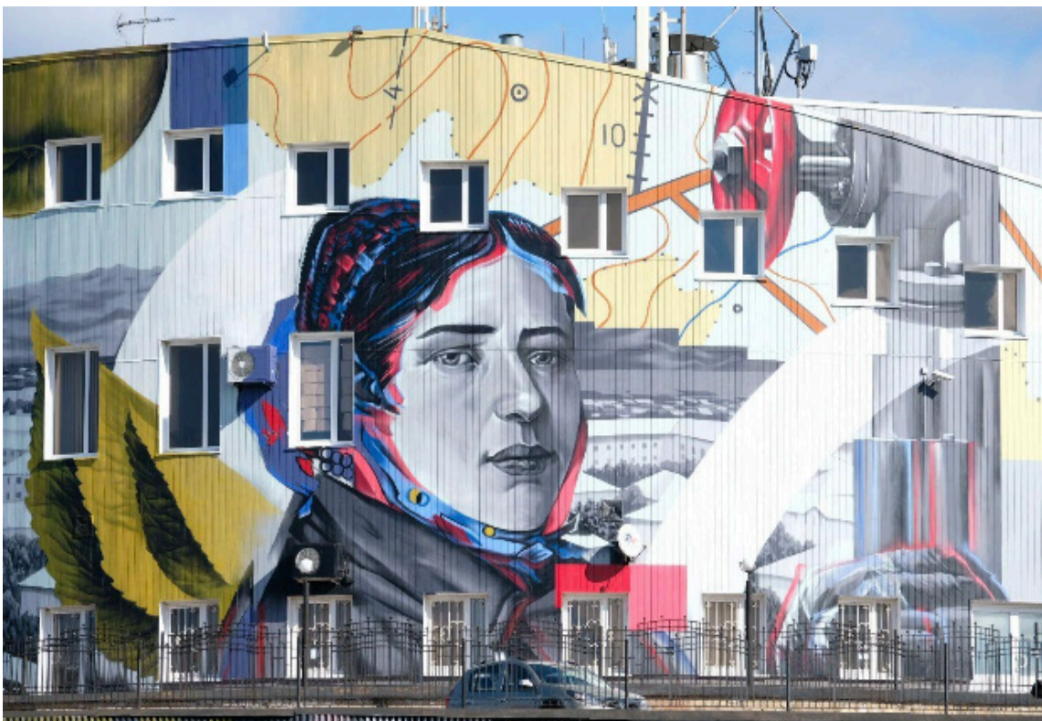
Figure 2 Hoodo (Moscow). The Land, 2017

The heroic work of oil production, along with the fairy tale of the golden apples is embodied in the painting the Gold of Tataria by Haris Yakupov and depicted in "The Land" mural (Fig. 2).