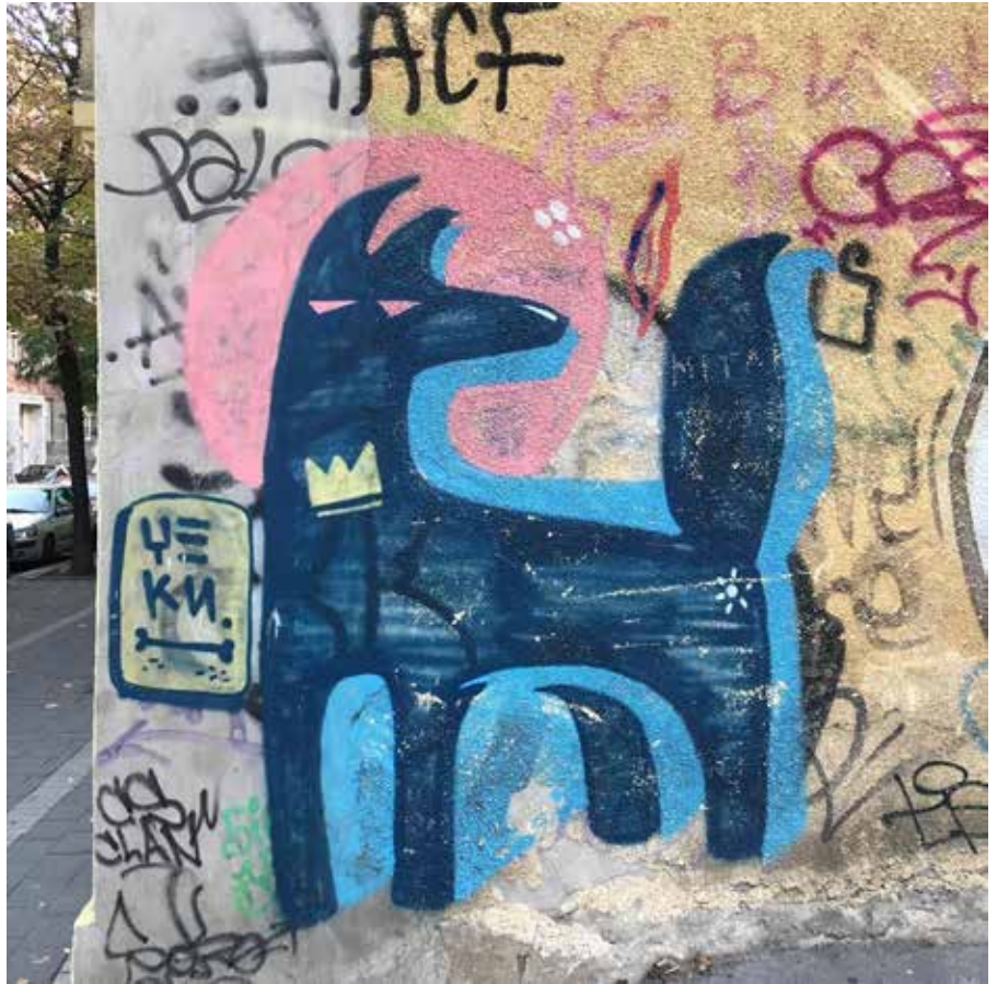
Figure 8. Џеки. Rage. Belgrade, Serbia, 201?. Photograph ©Street Art Walks Belgrade / STAW BLGRD.