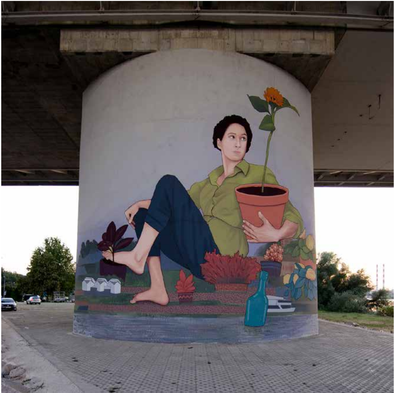
Figure 1. Plant a tree – Send a message. Artez. Belgrade, Serbia, 2019.

This one belongs more in the environmental art category, while a still of the video from we - copper & copper - us: mineralizacija project offers a more complex involvement (Figure 3). There, the source material goes between actual human involvement with nature - extraction of copper by the metal industry in Bor, the scientific and other processes that accompany it, presented as multimedia, still with an