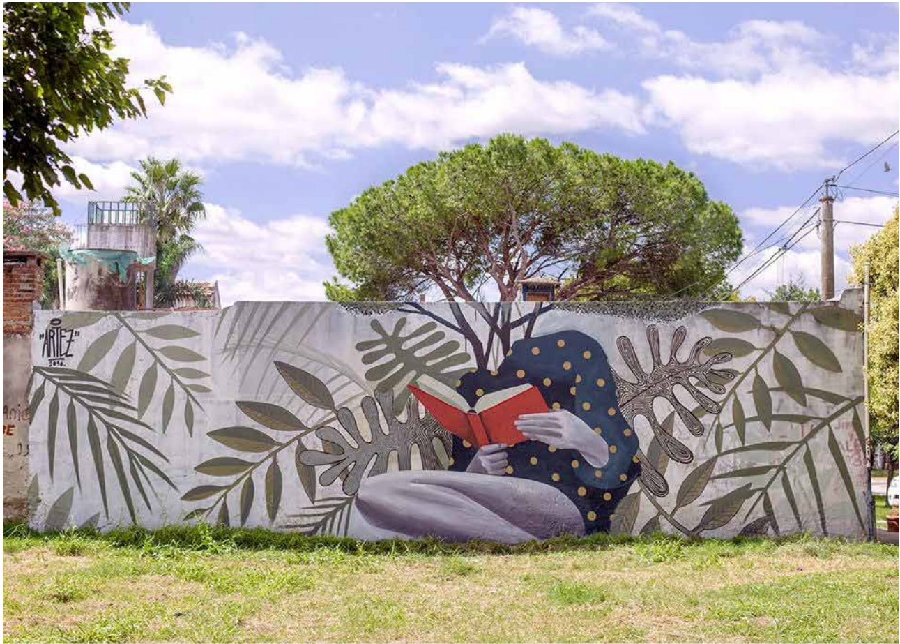
Figure 23. Reading makes you grow, Campo en Blanco project. Artez. Armstrong, Argentina, 2016.

nature, that's why I'm trying to bring a bit of greenery to the space I'm working in by using floral motifs" (Interview with Artez, 2020). Junk says similarly: "My works in a way point to the fact that we need more green areas in the city, and by using colors and motifs from nature I'm creating an image about how important it is for a city to have its little green oases" (Interview with Junk, 2019).