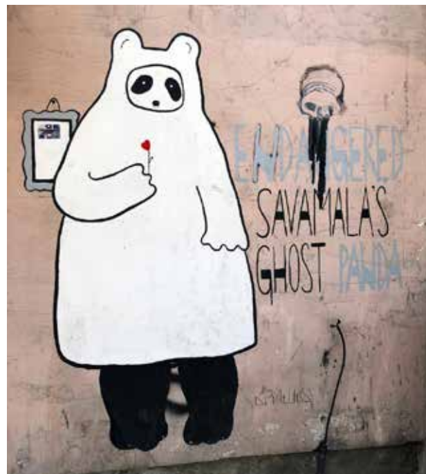
Figure 25. Endangered Savamala's Ghost Panda. Studio Kriška. Belgrade, Serbia, 2013.

Many artists are focused on humans and their relation to the city environment and nature. wrnkl's philosophical messages, as previously mentioned, target homo- and trans- phobias, violence towards people and animals (as in Ne tuci (p)se - Don't beat dogs/yourself , Figure 26), and aim to influence people's perceptions in a playful and