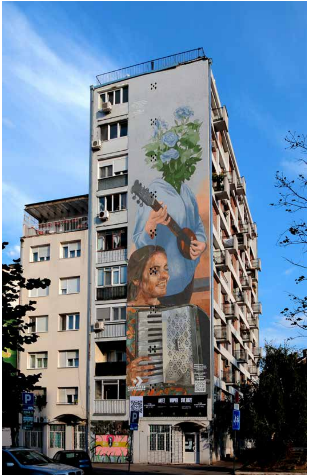
Figure 33. Celebrating our roots. Artez & Wuper. Belgrade, Serbia, 2020.