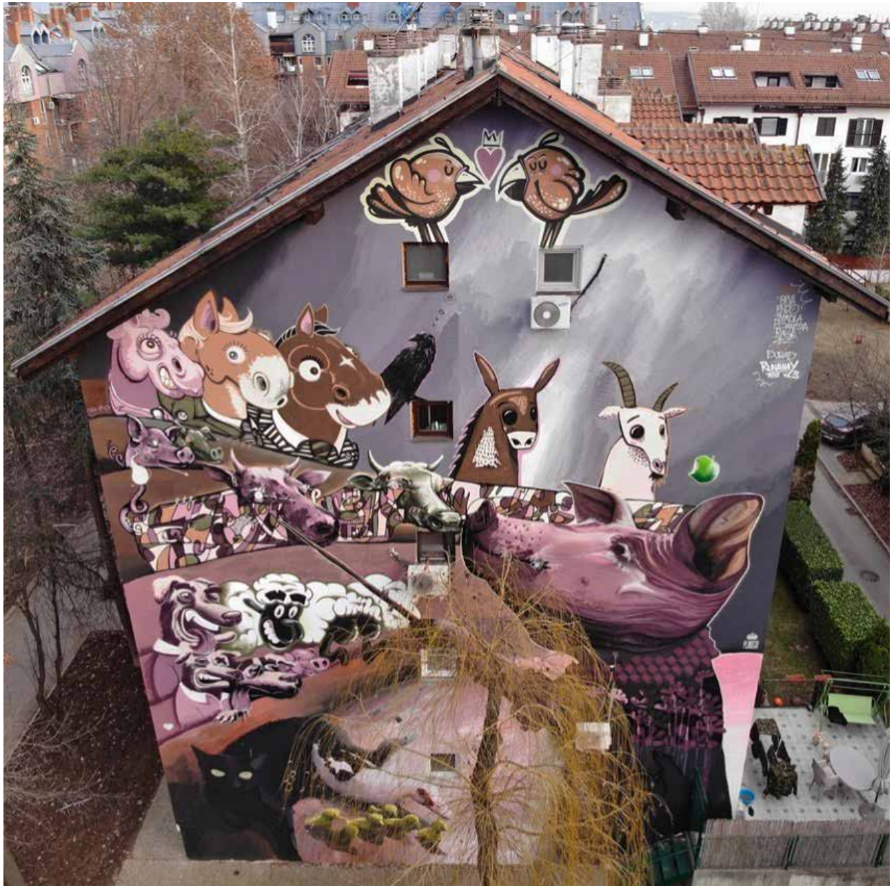
Figure 17. Runaway Festival 2018. Belgrade, Serbia, 2018.