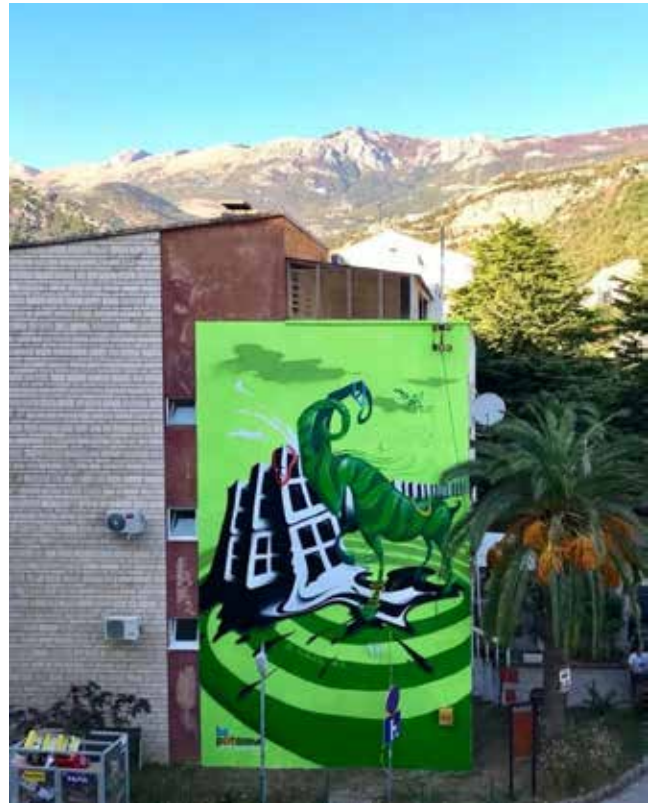
Figure 27. Be pArt Budva festival. Budva, Montenegro, 2016.

day by day” (Start Street Art Belgrade, 2014b). The mural is more current than ever given that the city government has initiated many reconstruction projects in the past years that removed trees and previously green spaces by filling them with concrete and insisting on the “concretization” of public space (Tešić, 2019). This is all happening in a period when there is a rising concern about the air quality, which has dramatically worsened during the 2019/2020 winter period.