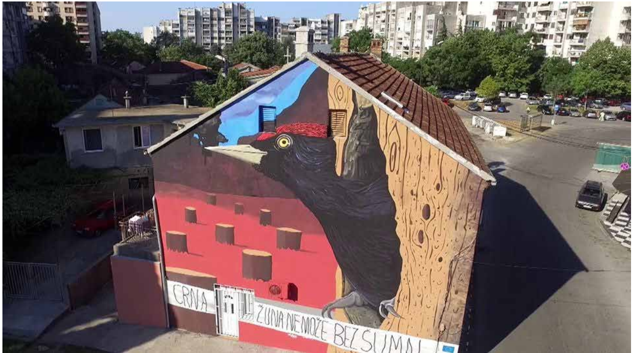
Figure 31. Crna žuna ne može bez šuma. Mišo Joskić. Podgorica, Montenegro, 2018. Photograph ©Mišo Joskić.

species. Another “urban-ecological” artwork by Piros represents the eastern imperial eagle (orao krstaš) that was unveiled in the lower Dorćol area, tied to a campaign by LAV beer and the Bird Protection and Study Society of Serbia (BPSSS), supported by the Association of Lower Dorćol (Figure 30). The aim of the campaign was to protect endangered birds and their habitat and rebuild it at Fruška Gora mountain. According to the mural initiators, at the time (2019), although the eagle is the national symbol, only one nesting pair was found in the country and BPSSS worked hard to provide them all the necessary resources to reproduce (B92, 2019; Piros, 2020: 41). In an example from neighboring Montenegro, Mišo Joskić depicted a deforestation scene warning the public about the habitat loss of black woodpeckers, initiated by the Center for Protection and Research of Birds (CZIP) (Đurović, 2018; Figure 31). Apart from being related to larger call-for-action projects, these works provide more context and involvement, by bringing attention to animals which require it, to paraphrase Brva’s words.