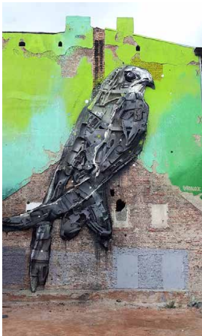
Figure 5. The Swift/ Apus Apus . Bordallo II. Lodz, 2015.

For the purpose of this text, several active street artists were contacted based on the presence of natural motifs in their work and nine out of twenty responded to a survey via Instagram between autumn 2019 and spring 2020. All are actively producing SAG, whether coming from (visual) arts, the very subculture of graffiti or other backgrounds: Jana, wrnkl, Lunar, Piros, Junk, ZEZ lunatic, Artez, Quam and Brva. Most have been active for the last