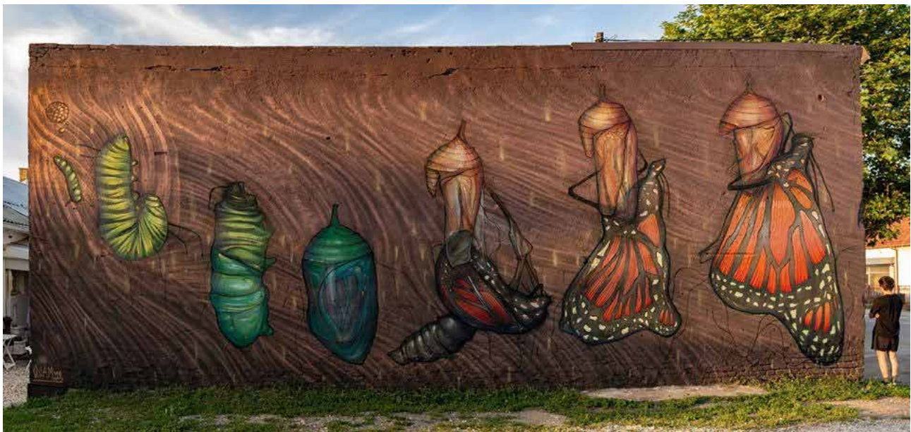
Figure 34. DUK Festival 2019. Quam. Čačak, Serbia, 2019.

The arts can synthesize and convey complex scientific information, promote new ways of looking at issues, touch people's emotions, and create a celebratory atmosphere, as was evident in this case study. In like manner, the visual and performing arts should be harnessed to help extend the increasingly unpalatable and urgent messages of global climate change science to a lay audience worldwide (Curtis, Reid, and Ballard, 2012).