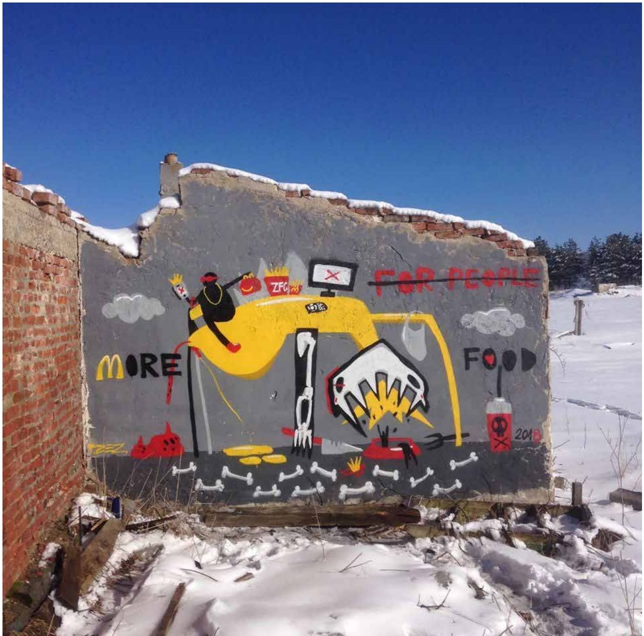
Figure 19. More food for people. ZEZ lunatic. Belgrade, Serbia, 2018. Photograph ©ZEZ lunatic.

food chains such as KFC and McDonalds (Interview with ZEZ lunatic, 2019). The artist finds it important to raise the consciousness of the onlookers: "For me, it's enough just to create a reaction, whatever it might be. Lethargy is worse than any bad reaction" (Milošević, 2018).