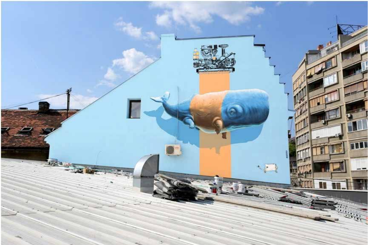
Figure 20. Imitation of life no. 9. Nevercrew. Belgrade, Serbia, 2014.

Poetic and symbolic approach is also utilized by Jana who covered many walls with jungle-like plants and often presents human hearts intertwined with swallows, waves, plants, and other elements that have personal and symbolic meanings. These are made as large-scale murals and more intimate paste ups, where Jana literally plants a seed in us: a heart made for Rekonstrukcija Festival 2018 has a growing branch poking out of it (Figure 21). Another, The Heart of the Mountain at Divčibare mountain was made for the Mountain Music Festival in 2018, 5 making a rare intervention into the natural surrounding itself (Figure 22). By utilizing visual symbols, she constructs a metaphor somewhere between notions of tamedness/civilization/smoothness and wildness (in a positive light), linking our inner wilderness with the one surrounding us (Interview