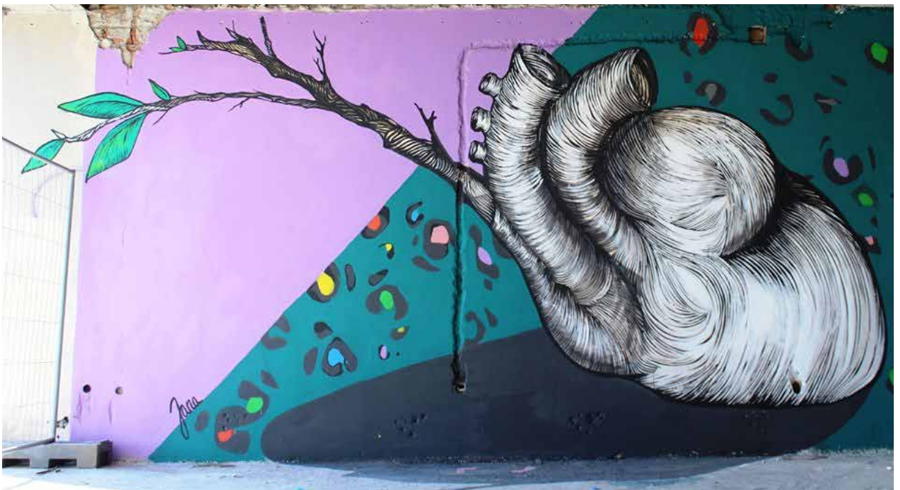
Figure 22. Srce planine (The hearth of the mountain). Jana. Divčibare, Serbia, 2018.