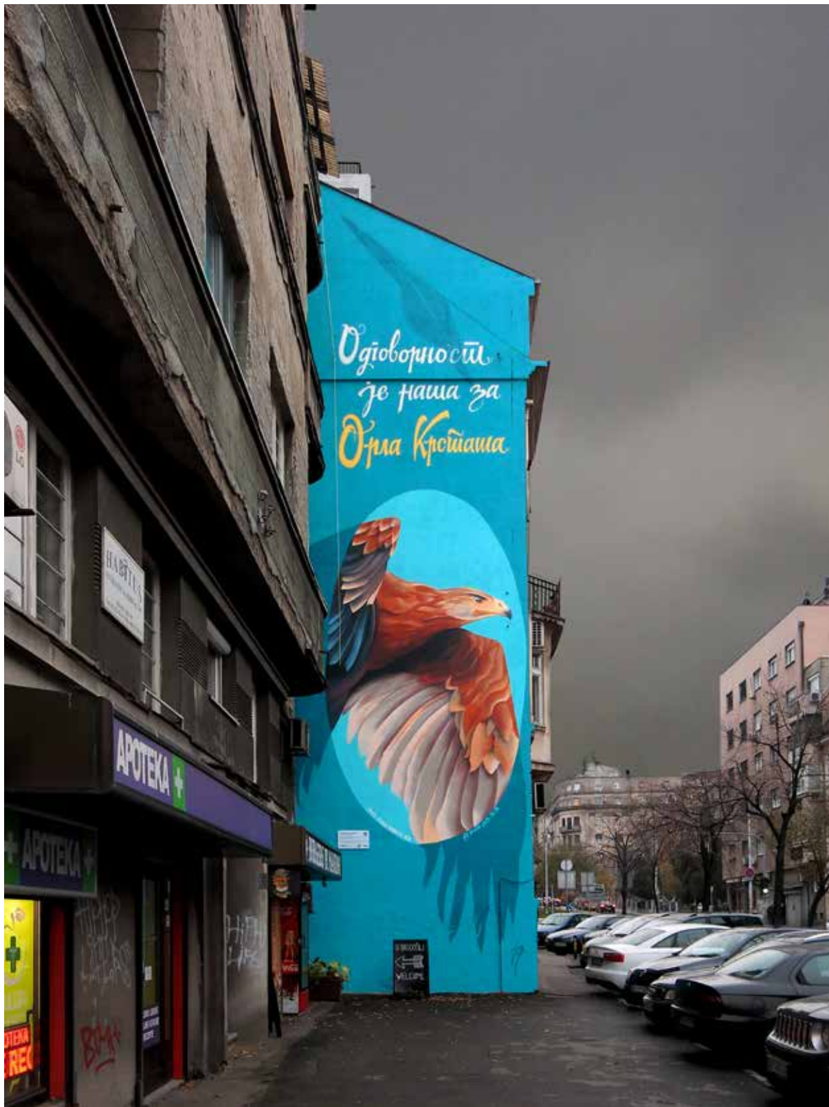
Figure 30. Odgovornost je naša za orla krstaša. Piros. Belgrade, Serbia, 2019.