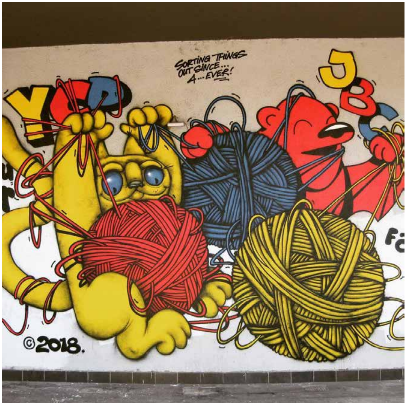
Figure 6. United Colors of Belgrade, Festival Rekonstrukcija 2018. Lunar & Flying Förtress. Belgrade, Serbia, 2018.