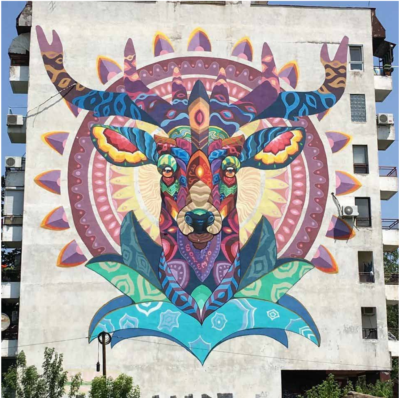
Figure 10. Runaway Festival & Donji Dorćol. Farid Rueda. Belgrade, Serbia, 2019.