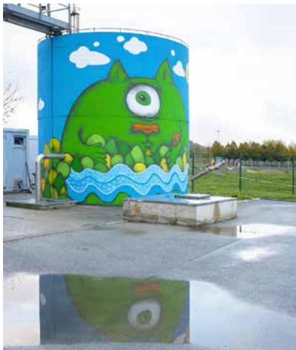
Figure 24. Protector. Lunar. Zagreb, Croatia, 2019.