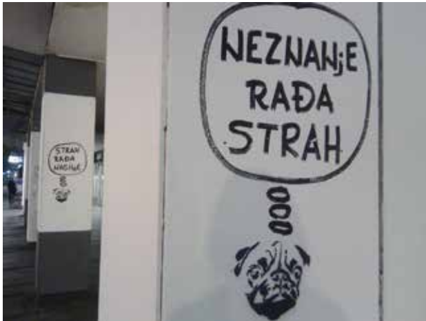
Figure 18. wrnkl. Belgrade, Serbia, 2014.

The environment does not stand-alone against political, social or economic issues; our daily reality is woven out of these entanglements. Environmentally engaged urban street art reflects this by critiquing everyday life through the social interstices it creates, and revealing new environmental understandings, raising an awareness of surroundings (Tunnacliffe, 2016: 18).