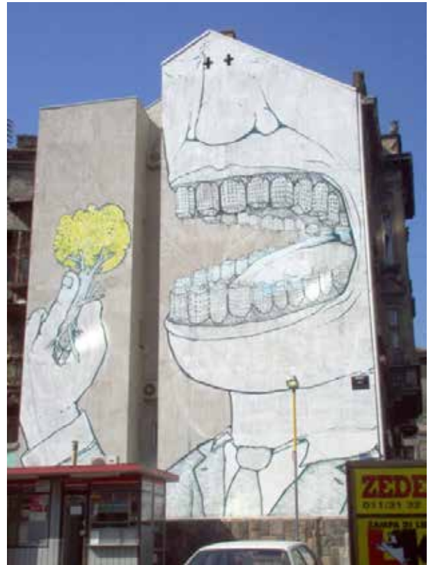
Figure 28. The tree eater. BLU. Belgrade, Serbia, 2009.