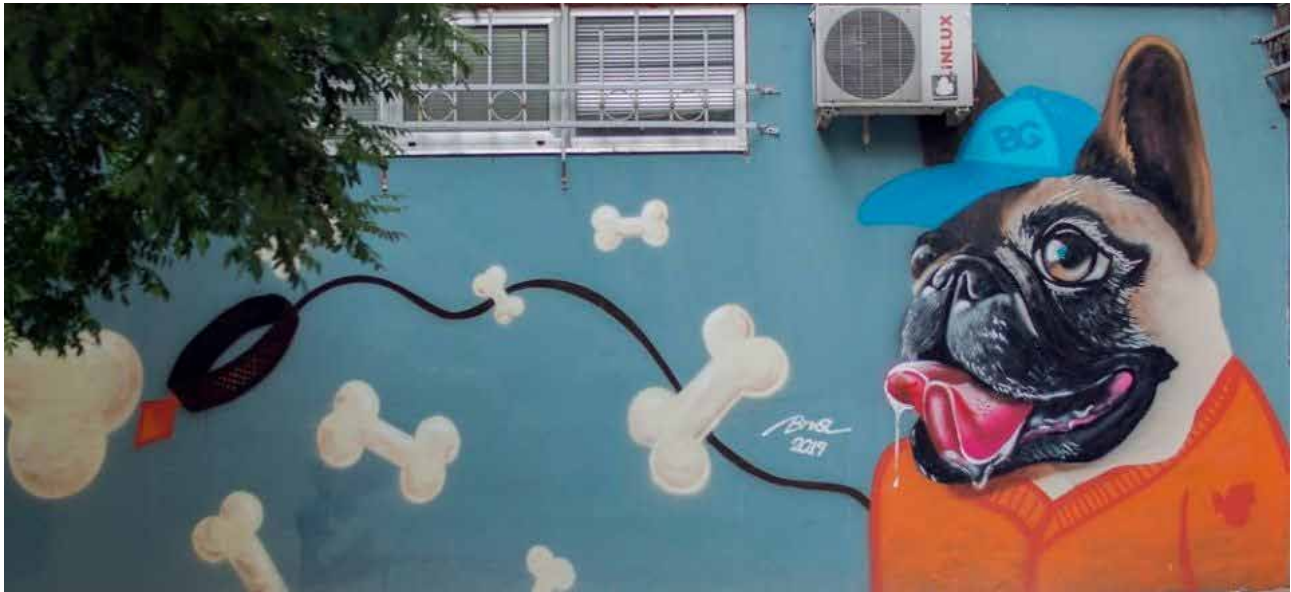
Figure 7. Festival Rekonstrukcija 2019. Brva, Belgrade, Serbia, 2019.

Piros has a distinct invented animal, which is a hybrid with a rooster's head and wasp's body, called Džamutka (Figure 9). He emphasizes that painting Džamutka is an "expression of my own freedom statement. She has a noble mission, to inspire and motivate on her path!" (Interview with Piros, 2019). According to Radošević: