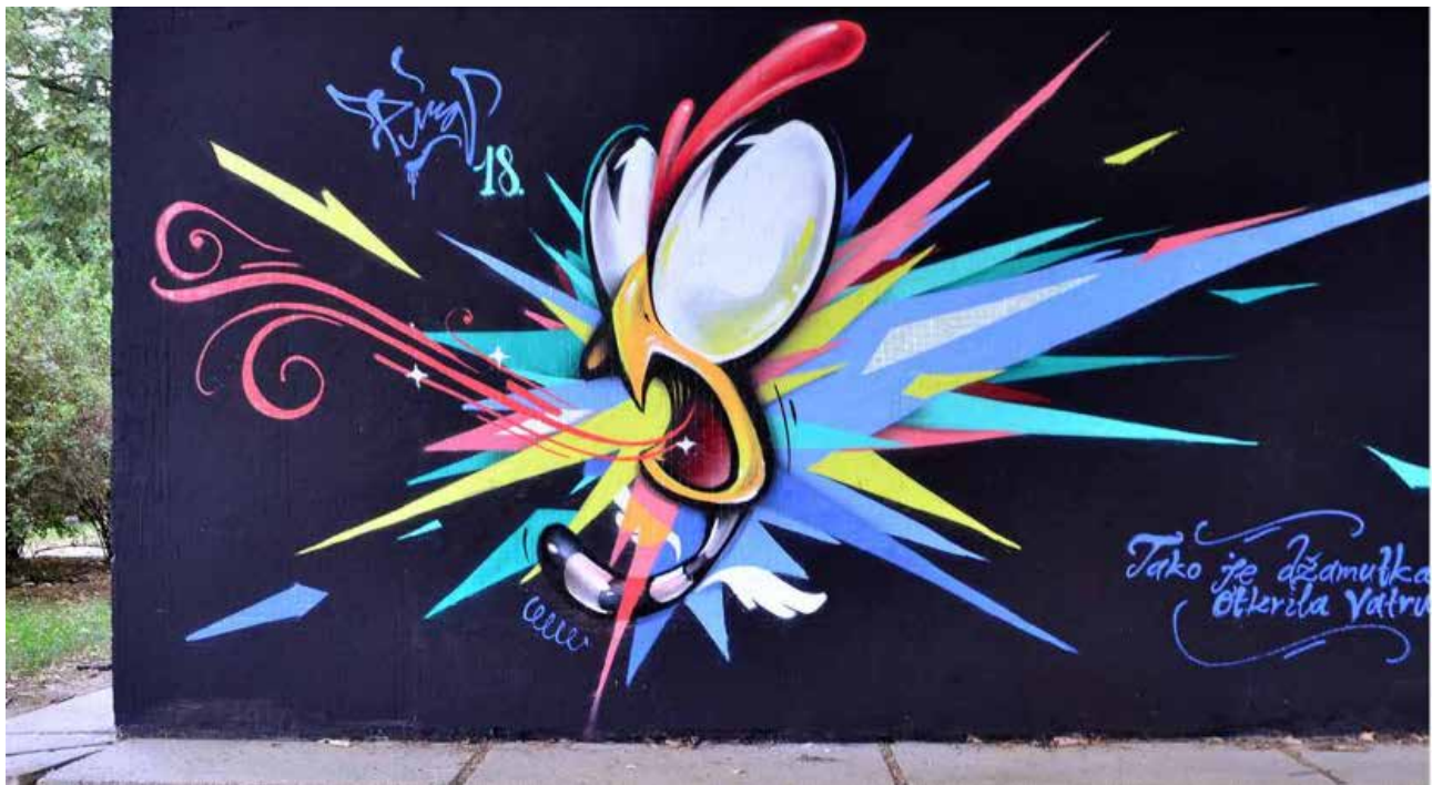
Figure 9. Džamutka. Piros. Belgrade, Serbia, 2018.