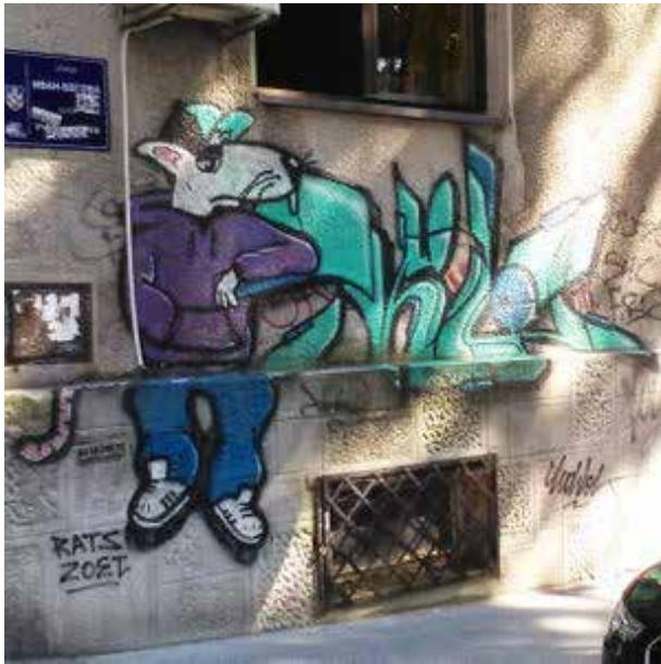
Figure 12. Rats. Belgrade, Serbia, 2013.