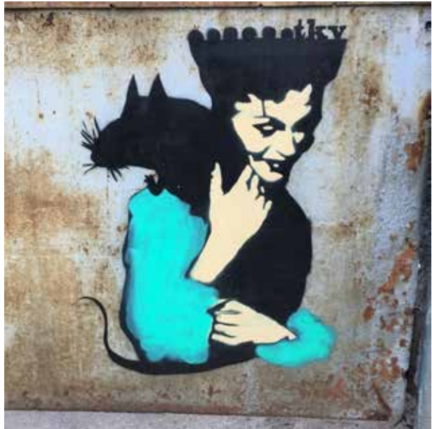
Figure 13. TKV. Belgrade, Serbia, 2018.

Many artists stated that by depicting natural motifs they are symbolically and visually participating in a project of making Belgrade greener. Junk, as well as Piros and Artez, emphasizes that his murals contribute to the effect of greenification of the city. In his words: