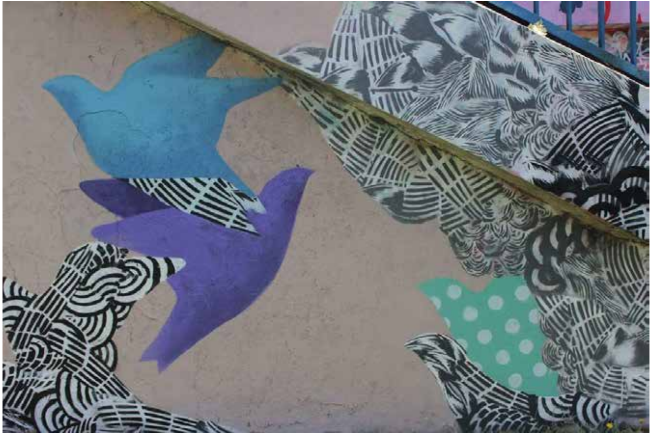
Figure 11. Jana. Belgrade, Serbia, 2017.

Ratz (or Rats) made a series of human-sized rat characters engaging in everyday activities and street scenes in 2013, reimagining the city dwellers as living in a hood (Figure 12). TKV - Kraljica Vila (The Fairy Queen) - also made a rat series between 2018 and 2019 (Figure 13), where she accepts them as one of street art & graffiti symbols. And this should be no surprise given the popular imagery of artists such as Banksy (UK) and before him Blek le rat (FR), the latter leaving his traces in the yard of the Cultural Center Magacin (Belgrade) in 2009. Blek le rat famously said that the rat is “the only free animal in the city” and their image reminds city people of often invisible and suppressed urban elements (I Support Street Art, 2017).