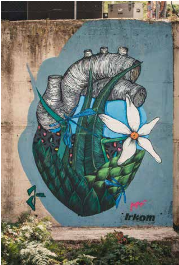
Figure 21. Festival Rekonstrukcija 2018. Jana. Belgrade, Serbia, 2018. Photograph ©Street Smart Belgrade.