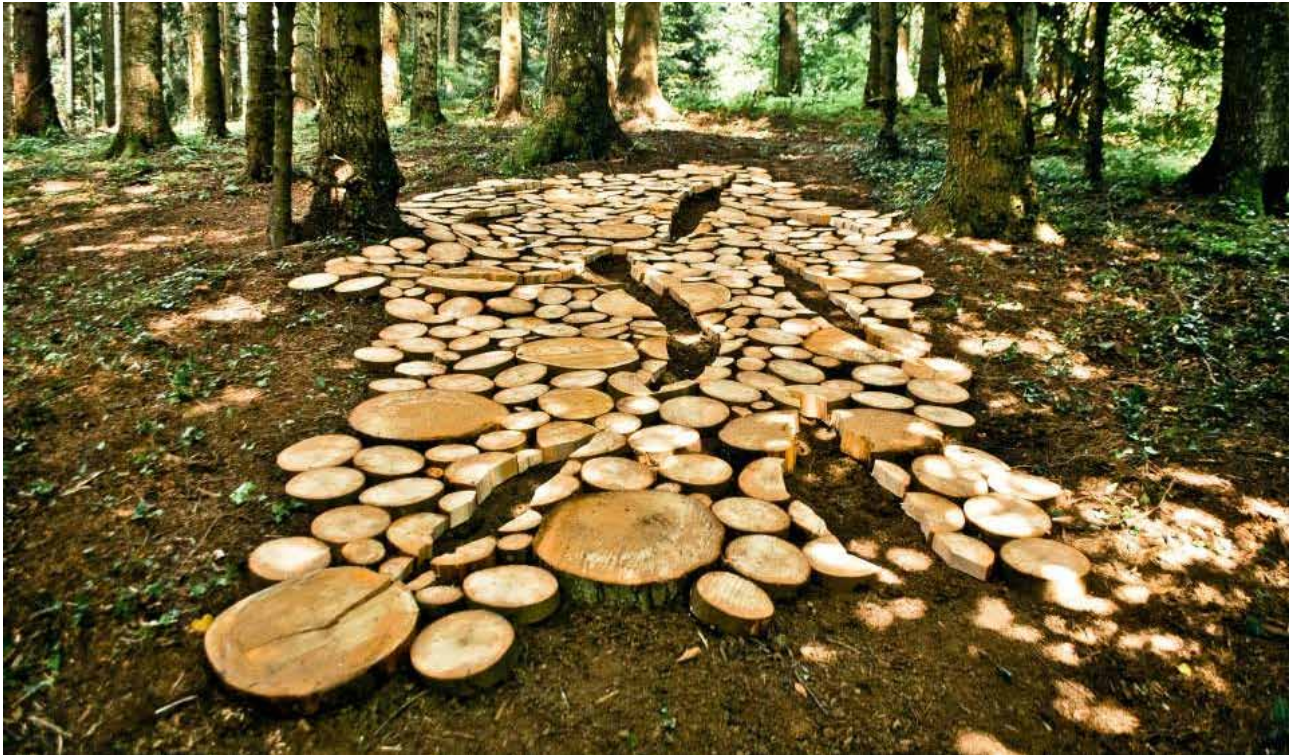
Figure 2. Pucanje nečega (The crack of something). Ars Kozara: art in nature laboratory #7, 2014. Goran Čupić. Mountain Kozara, Prijedor, Bosnia and Herzegovina.