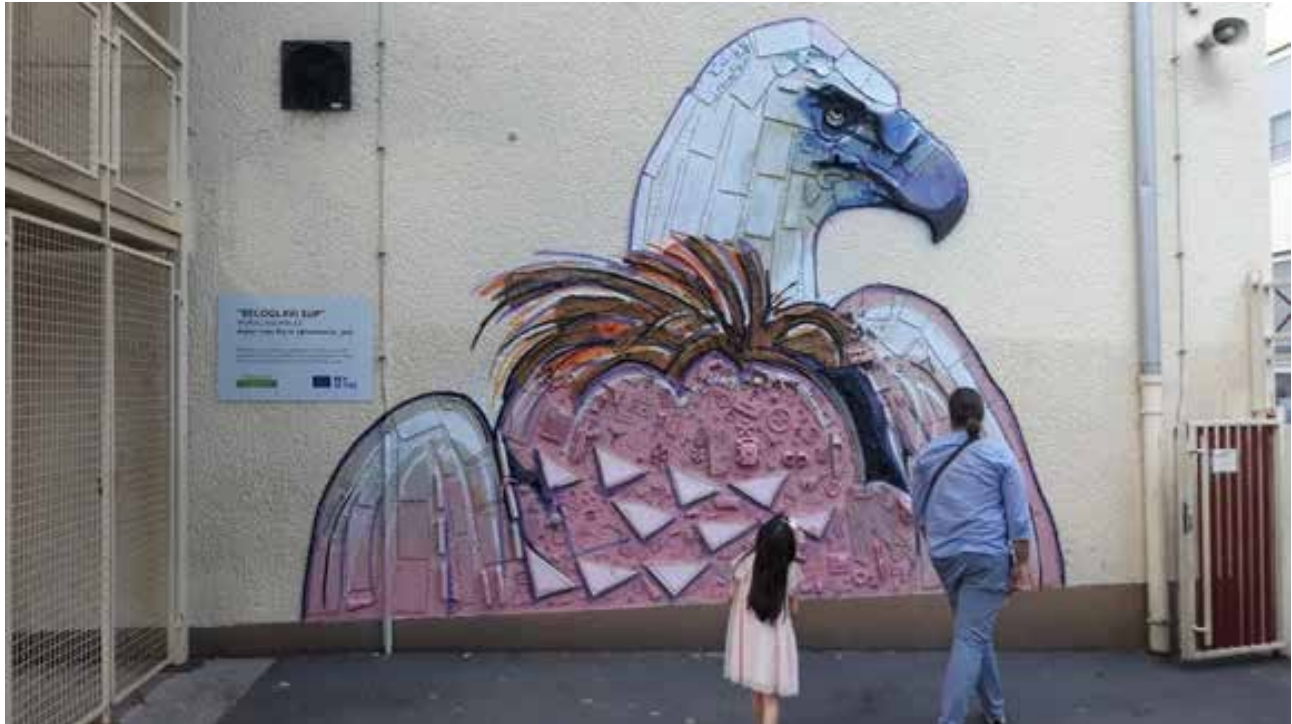
Figure 32. Beloglavi sup (Griffon Vulture). Ivan Kocić. Belgrade, Serbia, 2019.

It is important to remember that nature and society do not exist in isolation from one another. Everyday life in the urban setting is made up of social and natural entanglements. To ignore their relation to one another is to ignore the very fabric of today's urban society, maintaining the invisible barriers between the two (Tunnacliffe, 2016: 7).