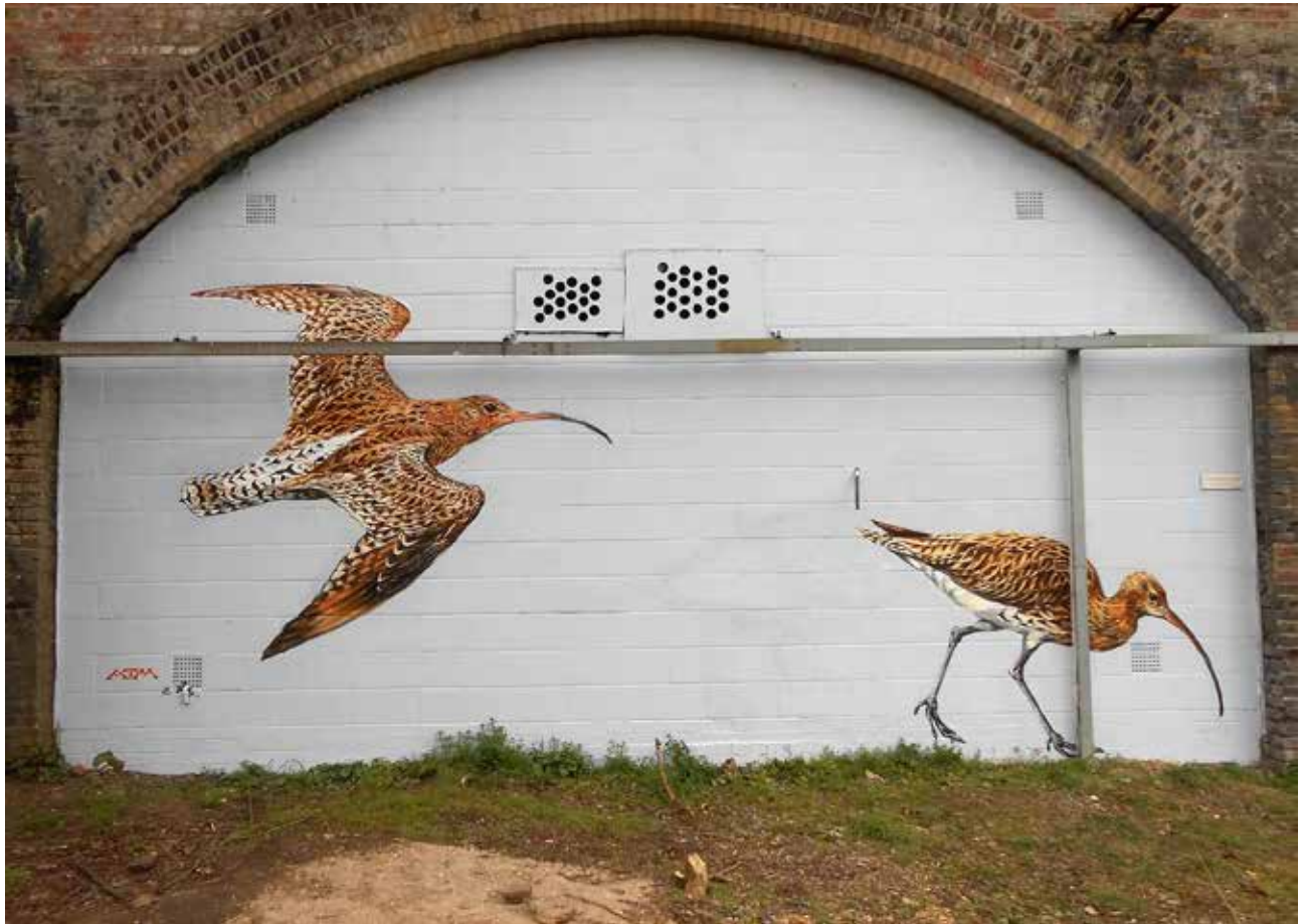
Figure 35. Curlew. ATM. London, 2016.

While both artists and ecologists can benefit from mutual collaboration on these issues, many raise concerns on how these initiatives could be framed and used. In her research about reverse graffiti, Norvaišaitė notes: "Since eco communication has seen a growing mistrust when coming from the government and industries (...), and graffiti is supposedly a socio-political commentary free of mainstream influences, street art could be a potential channel of environmental communication" (Norvaišaitė, 2014: 3). As an independent practice, within SAG ecological murals could tackle biodiversity and shift attitudes, where both the artists and the viewers are directly visually engaged in its ecological messages (Arrieta, 2014), whether part of official projects or bottom-up initiatives.