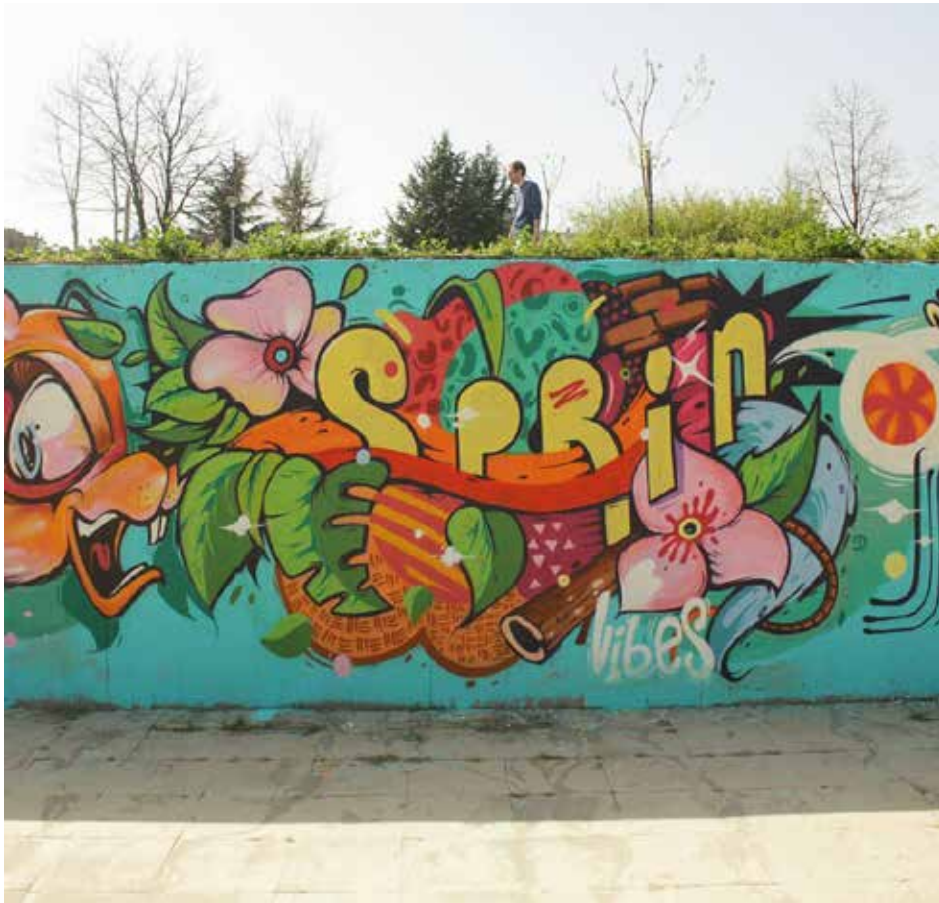
Figure 15. Artez. Belgrade, Serbia, 2017.