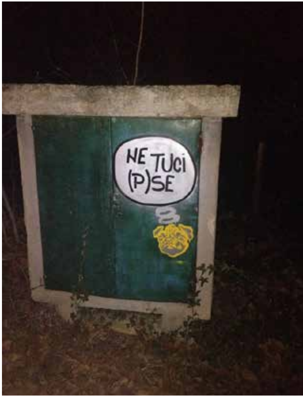
Figure 26. Ne tuci (p)se. wrnkl. Srebrno jezero, Serbia, 2014.