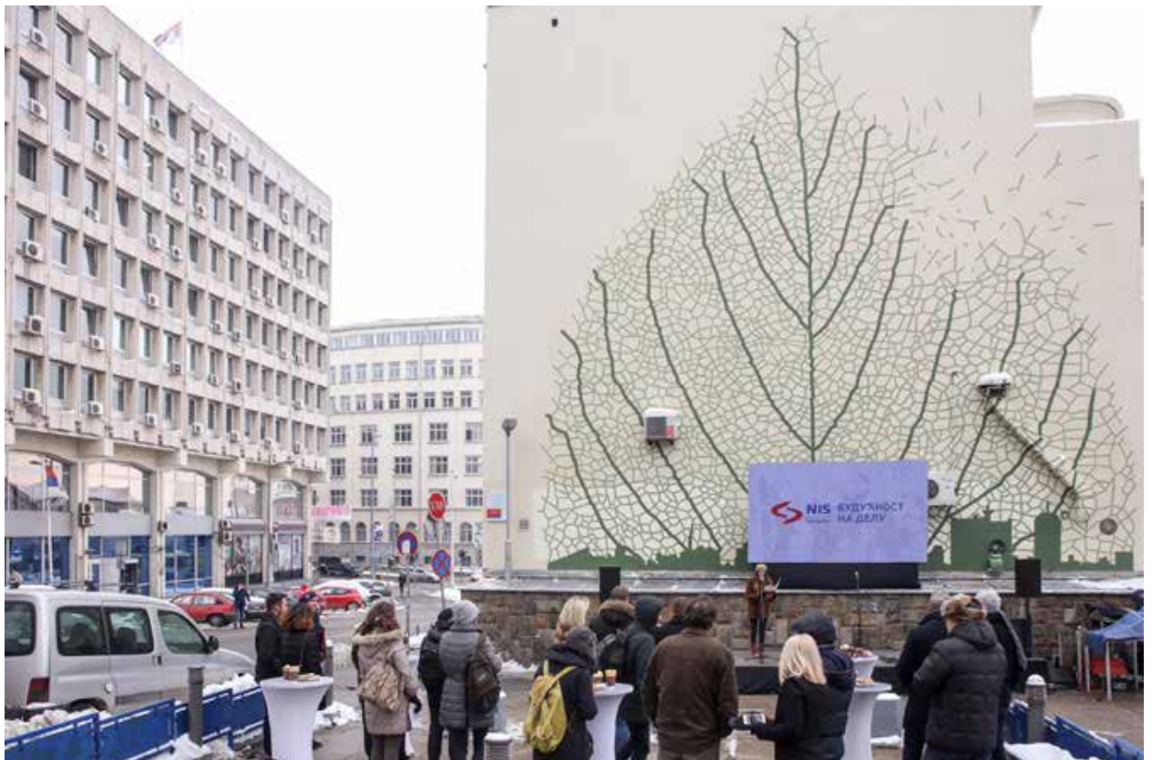
Figure 29. Zeleni grad - nova energija. Sara Antov and Dragan Vuković. Belgrade, Serbia, 2018.