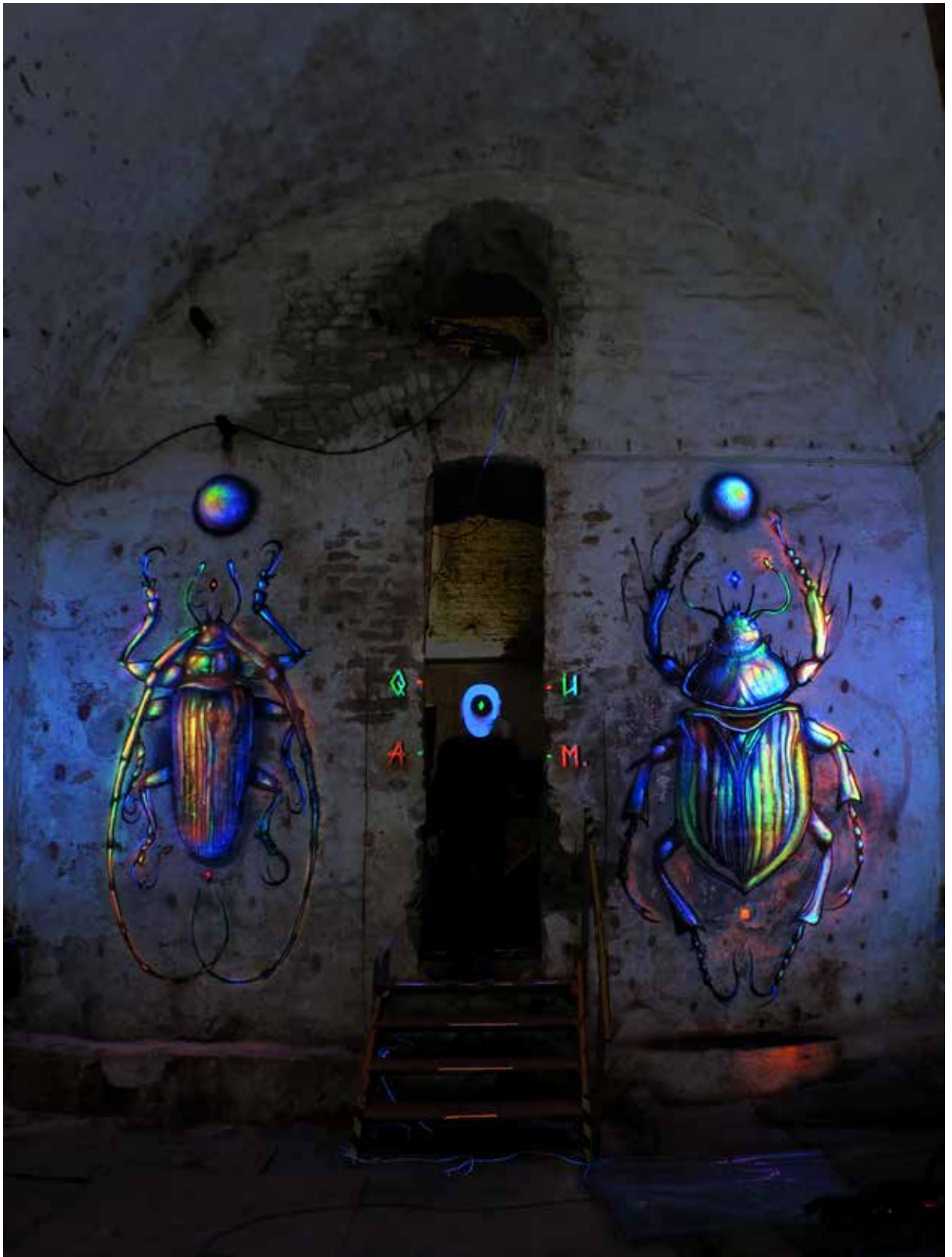
Figure 14. Quam. Belgrade, Serbia, 2019.