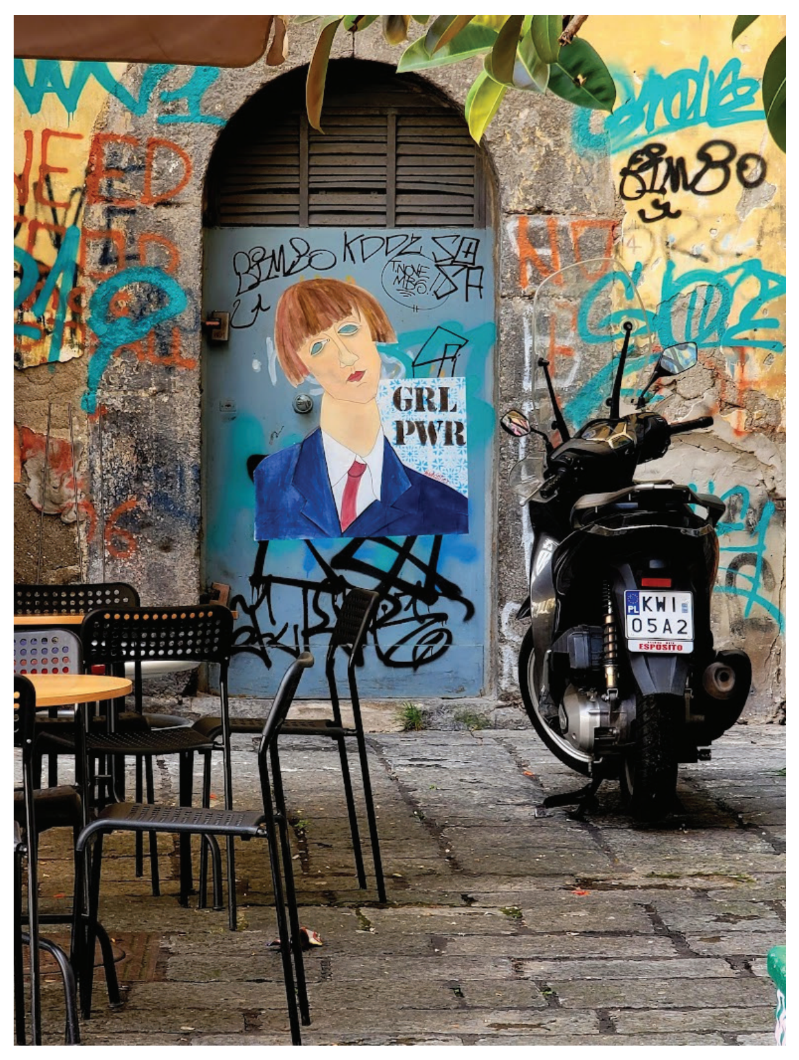
Figure 7: Street graffiti around Napoli, Italy.