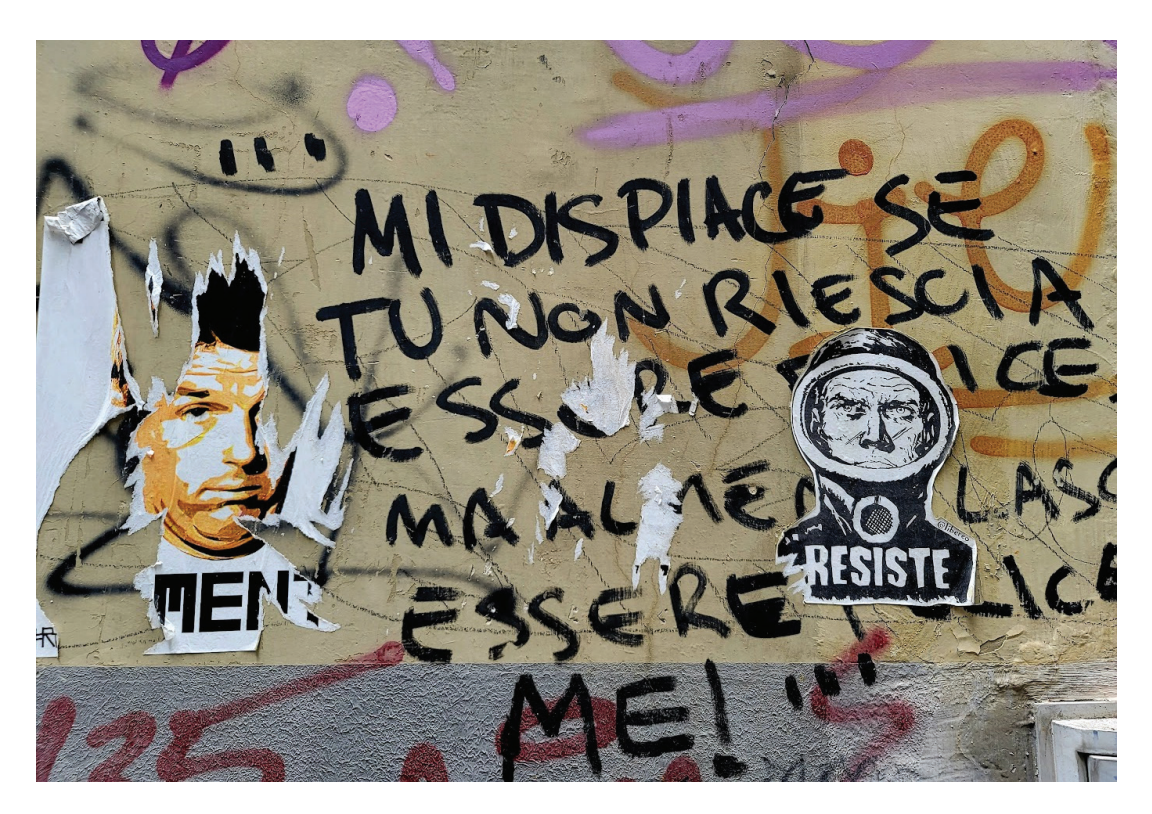
Figure 2: A mix of paint, marker, and wheat-pasted images adorn the walls of a street in Napoli.