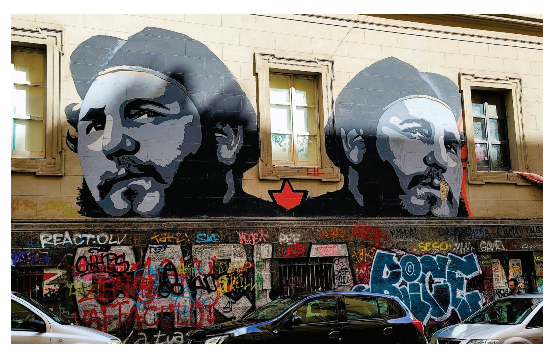
Figure 1: A mirrored portrait of Che Guevera complements various styles of graffiti and wheat-paste along the streets of Napoli, 2022.