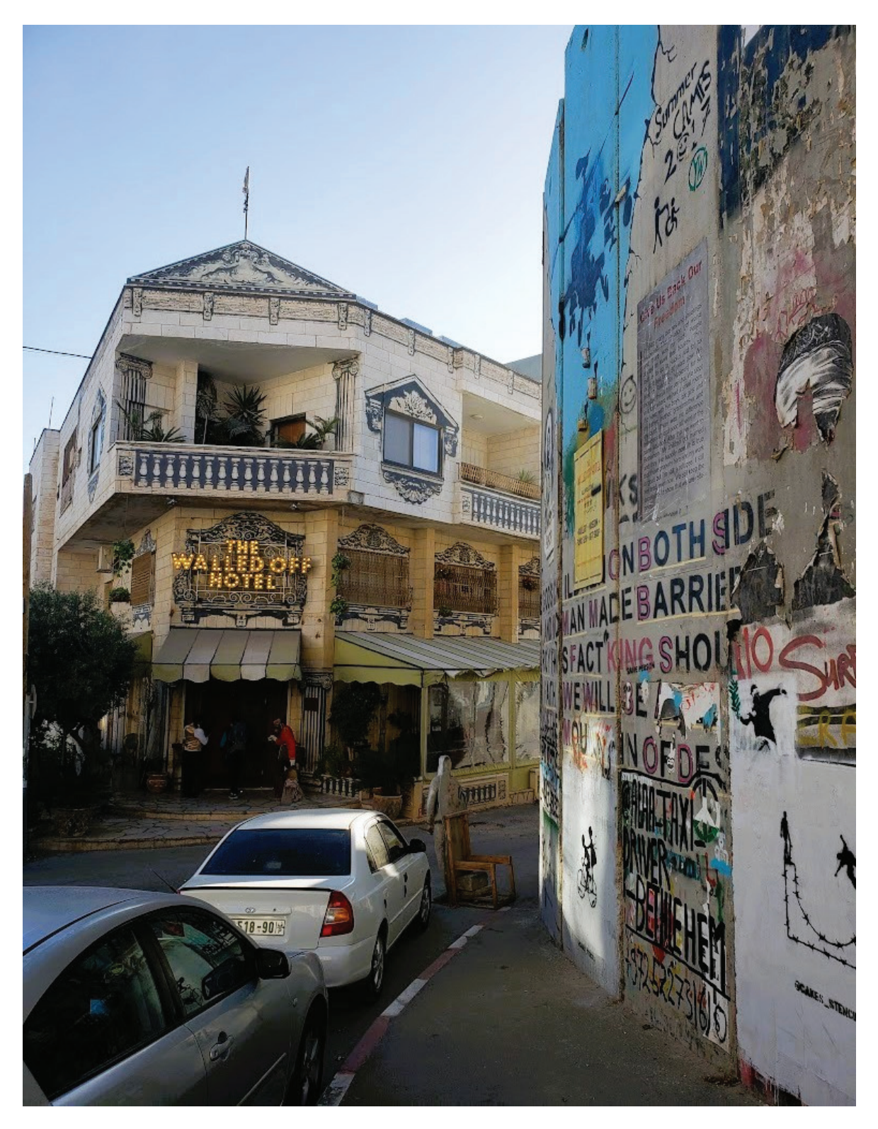
Figure 6: View from Caritas Street next to the Annexation Wall outside the Walled Off Hotel, 2019.