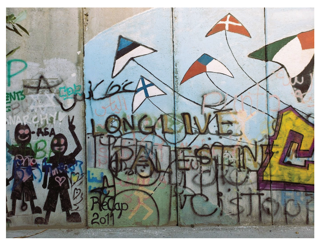
Figure 3: Graffiti on the Annexation Wall, Bethlehem, Palestine.