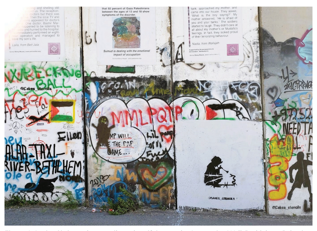
Figure 4: A mix of infographs, stencils, and graffiti cover the Annexation Wall, Bethlehem, Palestine.